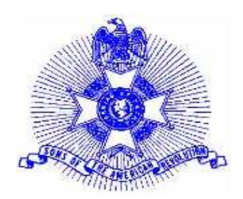
The Mother Lode Chapter Sons Of The American Revolution

Editor-Tom Douglas 530-677-3905 Email: tommyd@cal.net