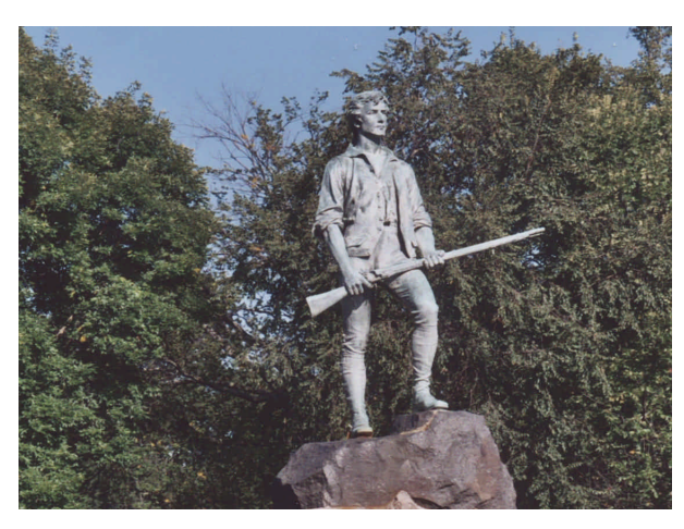
Minuteman on the Lexington Green.