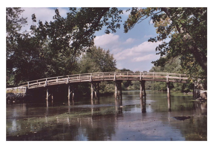
North Bridge at Concord, MA.