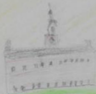
Independence Hall Location of the signing of the Declaration of Independence

The Declaration of Independence is a timeless moral and ethical statement of ideals for all people and are even relevant today. It was approved by the Second Continental Congress on July 4, 1776, during the American Revolution. The document declared America's independence from Great Britain, why they were separating, and listed the rights of mankind. The original rough draft of the Declaration was written by Thomas Jefferson; which was then edited by the Continental Congress. It remains an important document for all people throughout history struggling for their rights of life, liberty, and the pursuit of happiness.