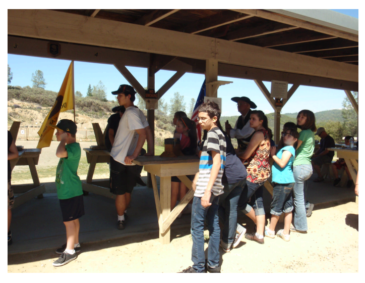
Note that the boy in the green shirt is holding his ears. While the guns are not too loud, it is better to protect one's ears.