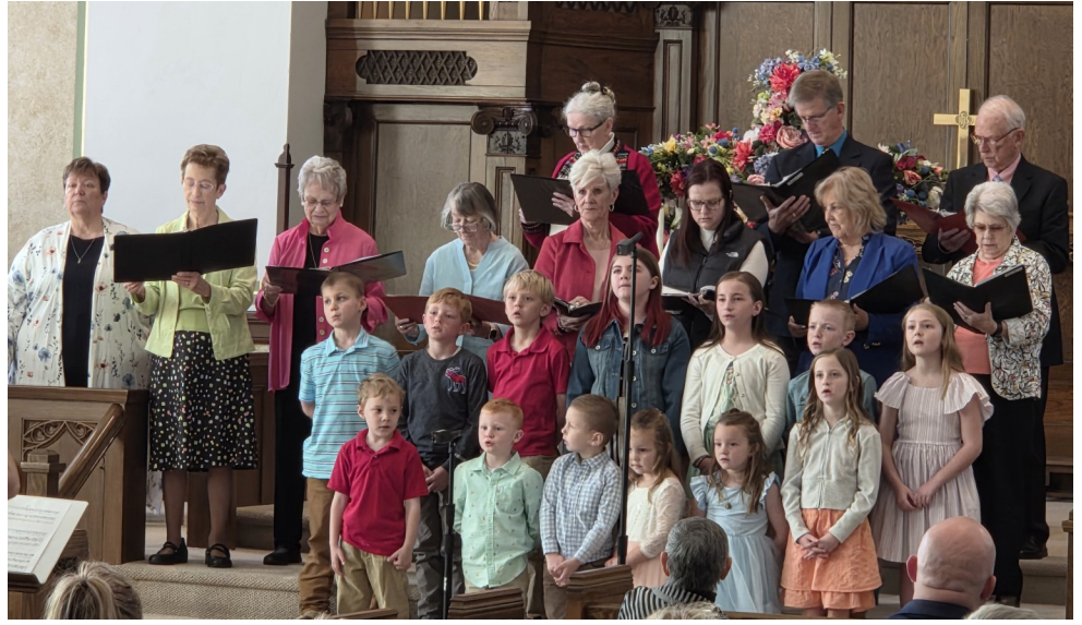
Above right: The Adult and Kids' Choirs sang during worship on Easter Sunday.