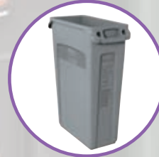
Slim Jim® Series