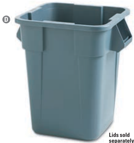
Lids sold separately