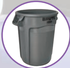
BRUTE® Containers & Lids

Ideal for Outdoor Extreme Weather Conditions