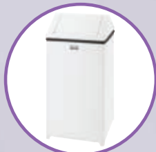
Plastic & Metal Containers