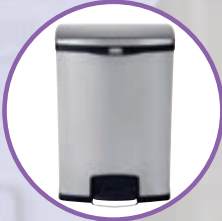
Slim Jim® Step On Series