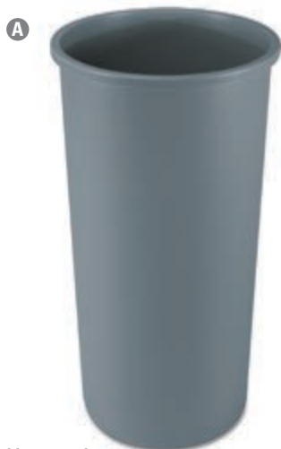
Lids sold separately