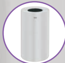
Metal Ash/Trash Containers