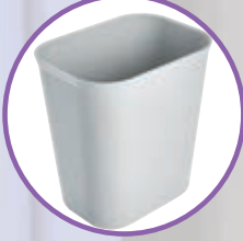
Plastic Wastebaskets & Lids