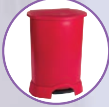
Step On Containers