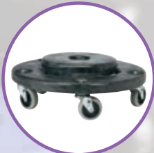
BRUTE® Accessories & Dollies