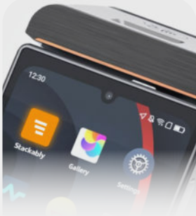
Free Smart Terminal Take in-person payments with no cost device.