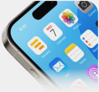
Stackably Customer App Access invoices, membership and community.