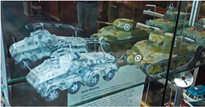
Right Middle of Middle Shelf