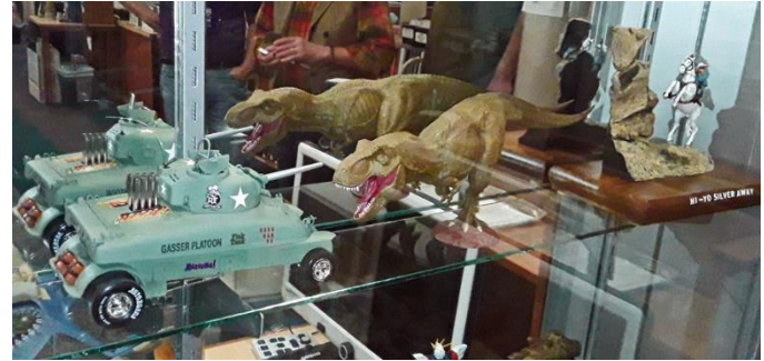
Right Middle Shelf