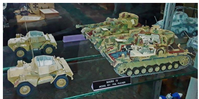
Left Middle of Middle Shelf