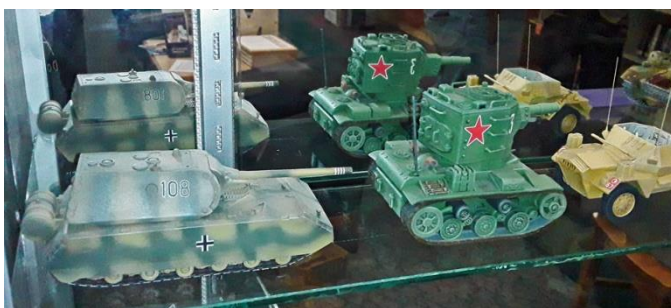
Left Middle Shelf