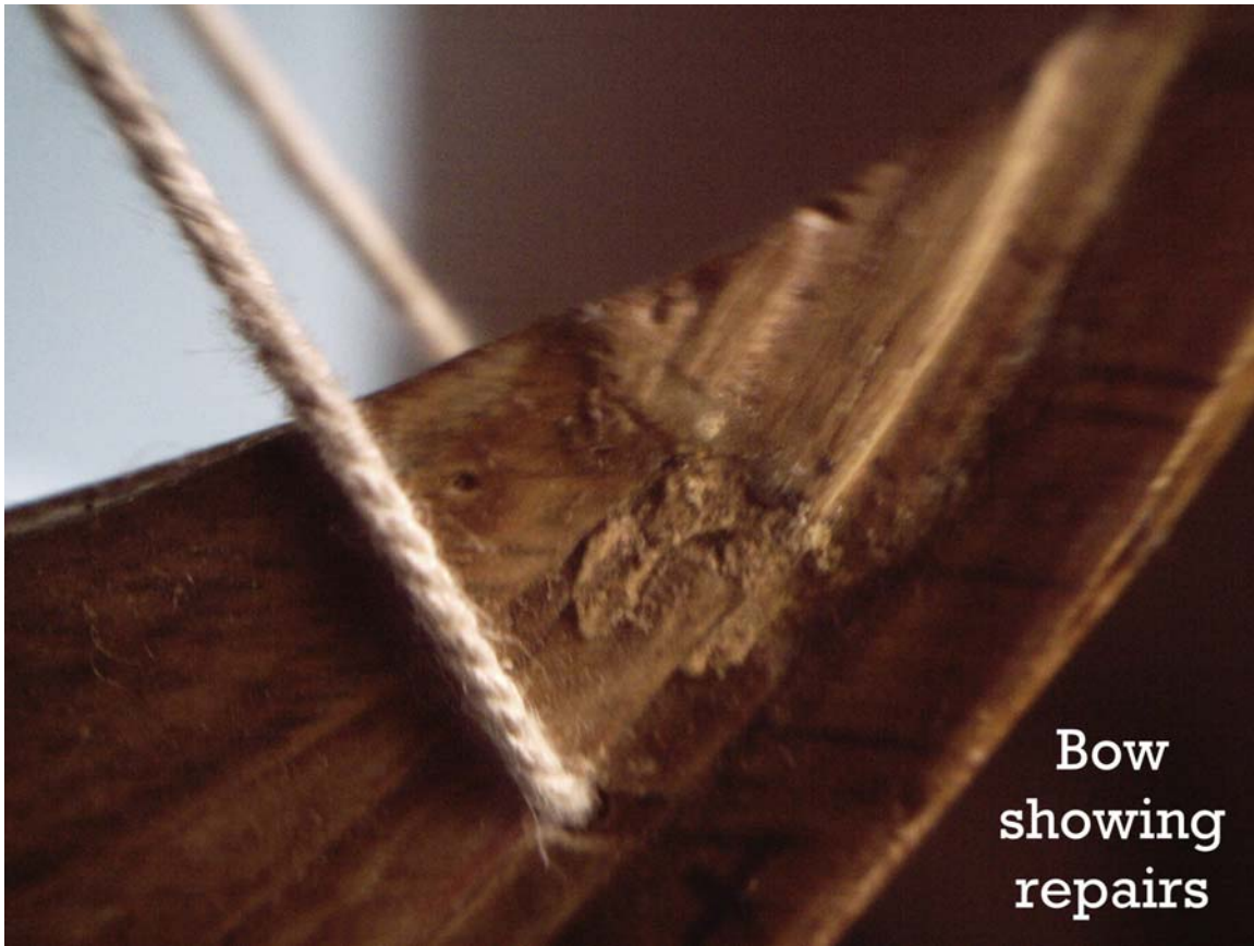
Bow showing repairs

I had big problems with the bow and stern posts breaking off almost every time the model is transported. This is because the grain of the plywood runs horizontally here and has no strength. Of course, plywood was not used on the real ship.