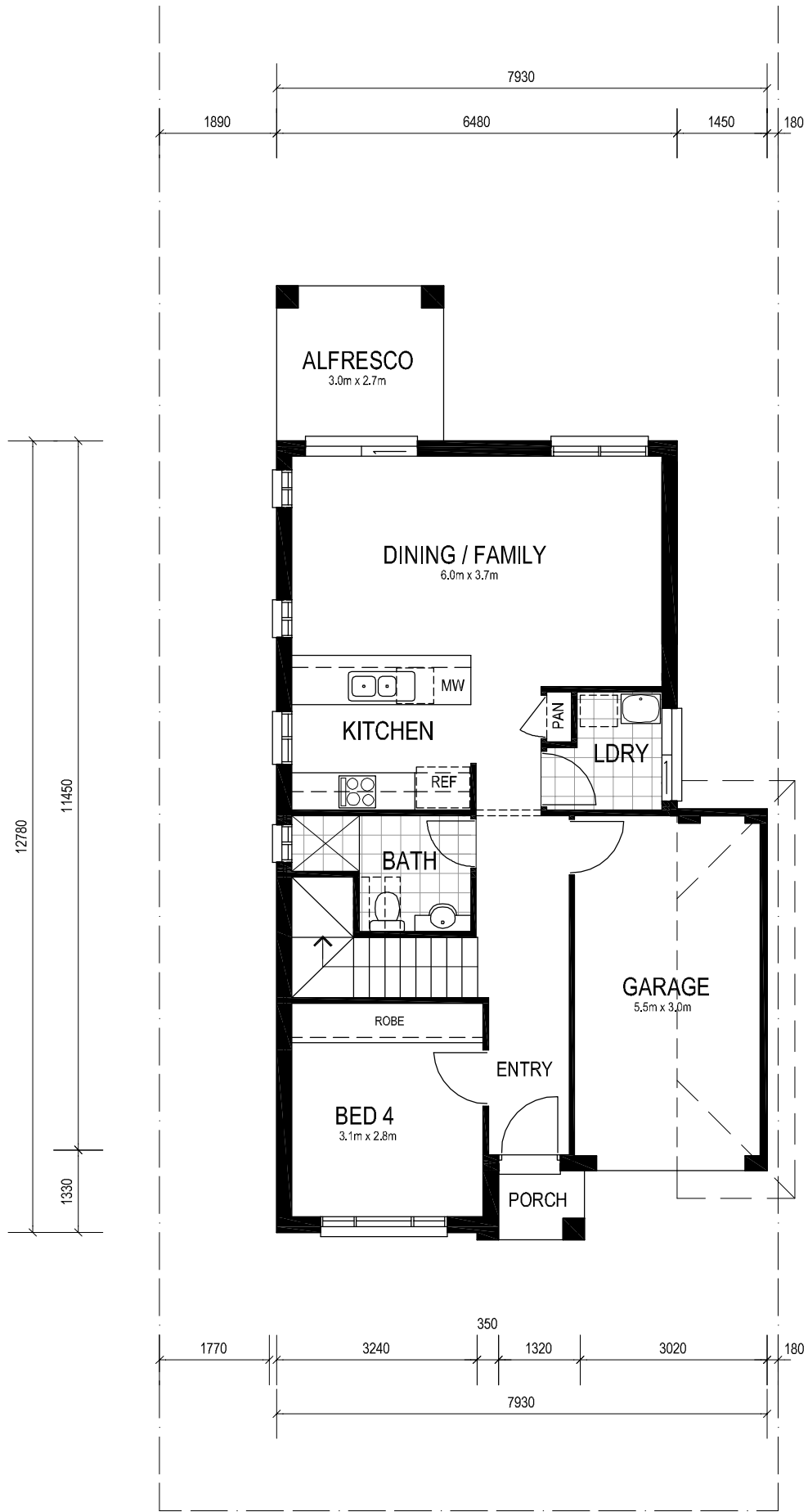
10m LOT WIDTH GROUND FLOOR