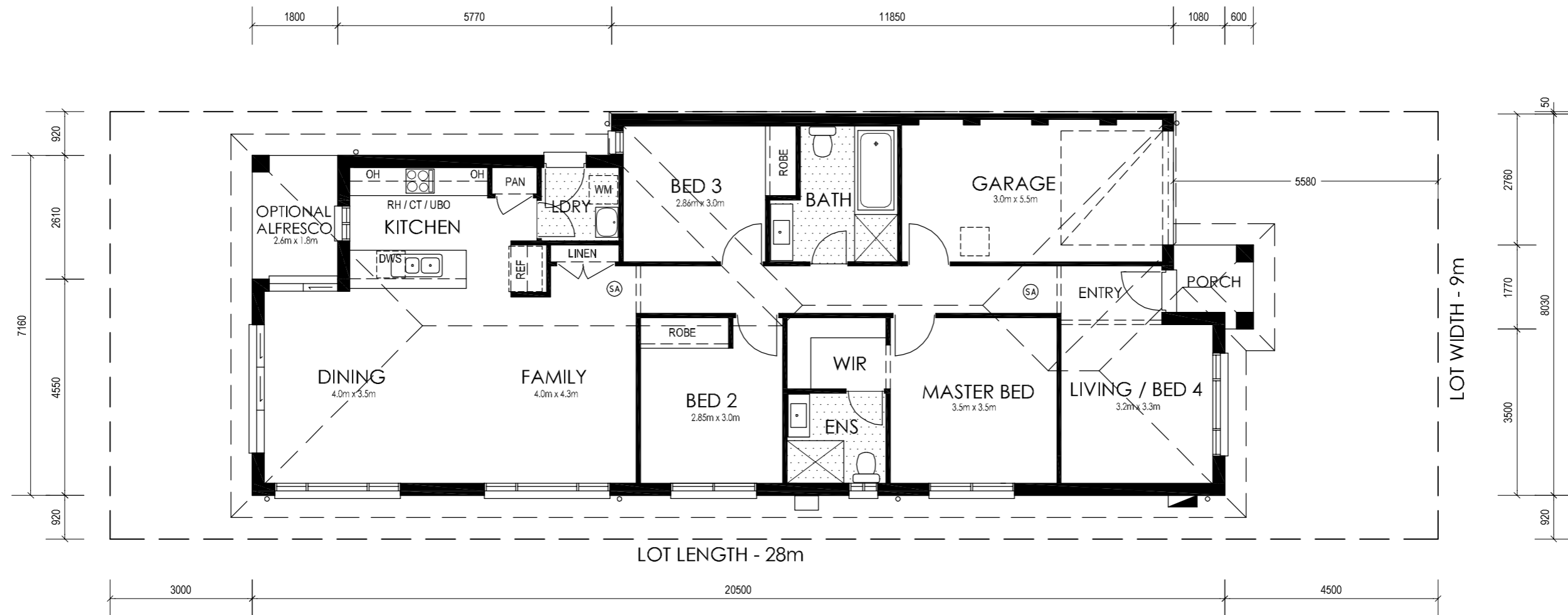
01 FLOOR PLAN SCALE : 1:100