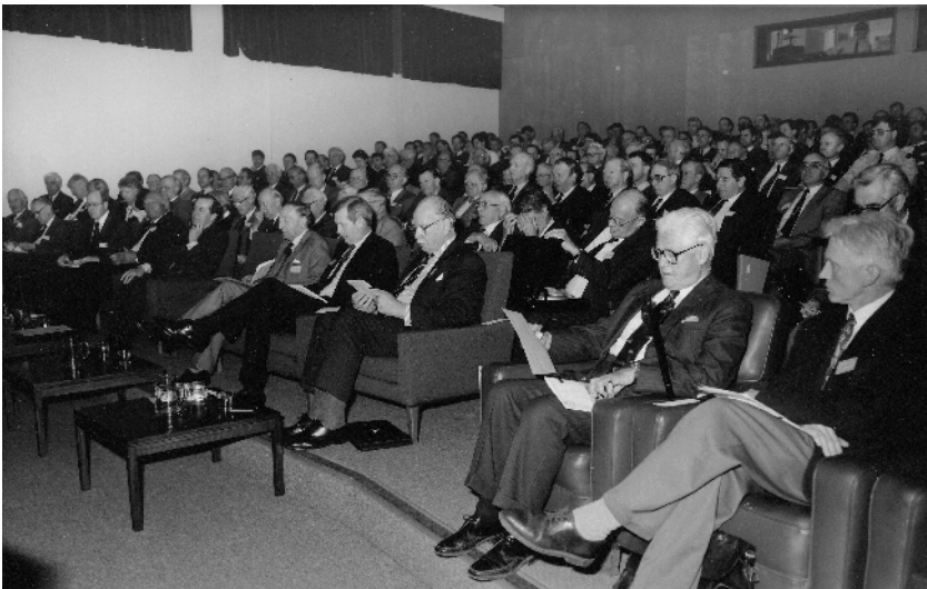
Brooke-Popham Auditorium – audience for main lectures.