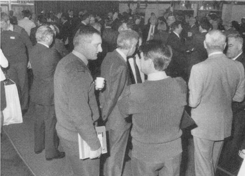
Assembly and coffee in the Flag Room