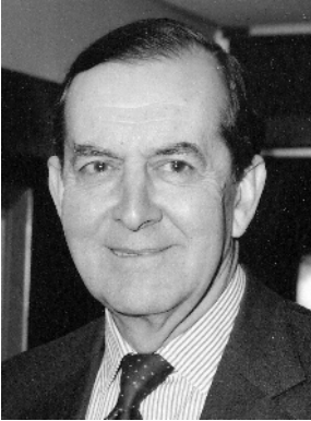
MRAF Sir Michael Beetham GCB CBE DFC AFC

Sir Michael Beetham took part in the strategic bomber offensive as a Lancaster pilot on 50 and 57 Squadrons in 5 Group from 1943-45. Much of his early post-war career was spent in Bomber Command, commanding 214 (Valiant) Squadron in the V-Force from 1958-60 and serving both as Group Captain Training and as Group Captain Operations at Bomber Command Headquarters between 1961 and 1964. His later appointments included Commandant of the RAF Staff College, Bracknell, Commander-in-Chief RAF Germany and finally Chief of the Air Staff from 1977-82.