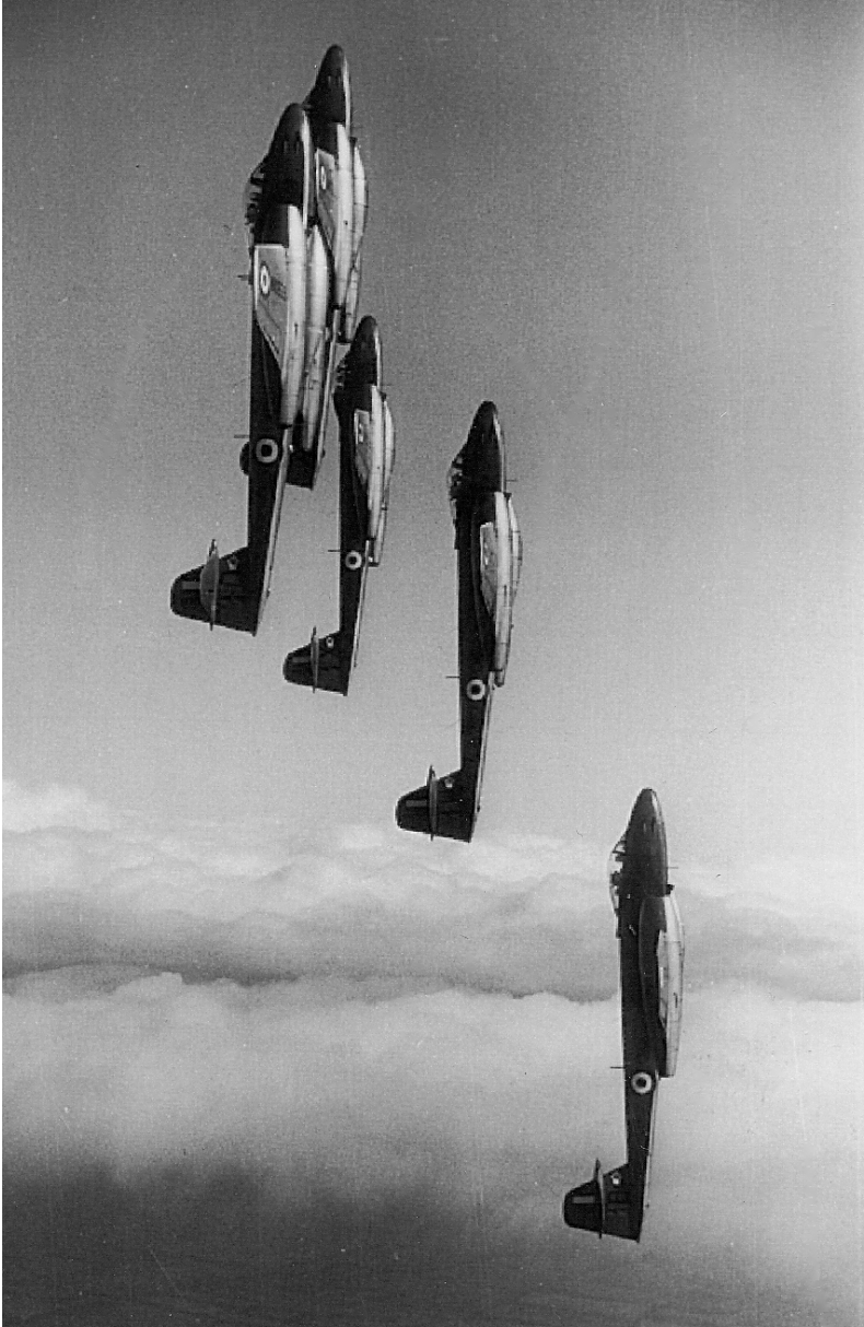
No 64 Sqn's formation team reaching for the sky in 1954.