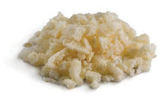
Cancellous, 4 - 10mm