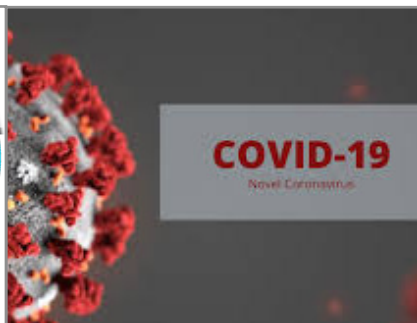
Relief for Nonprofits p.4 Individual Checks p.8