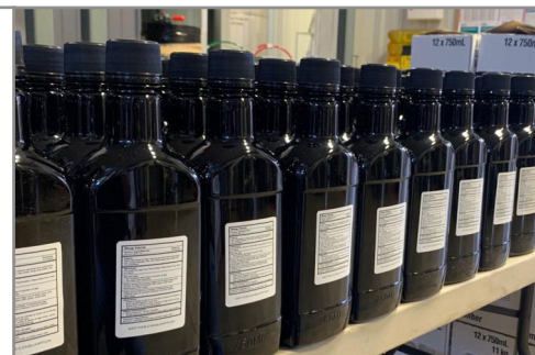
West Virginia Whiskey to Hand Sanitizer p.5