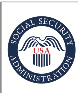
SSA Economic Impact Payments p.3