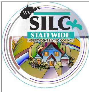
Public Meeting Notice for Draft State Plan for IL p.2