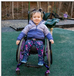
Kanawha State Forest Accessible Playground p.4