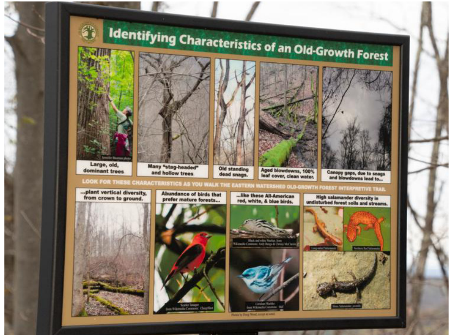
To help visitors better understand what to look for, Kanawha State Forest Foundation volunteers have erected a series of interpretive signs along the park’s East Boundary Road and Hoffman Hollow Road/Trail.