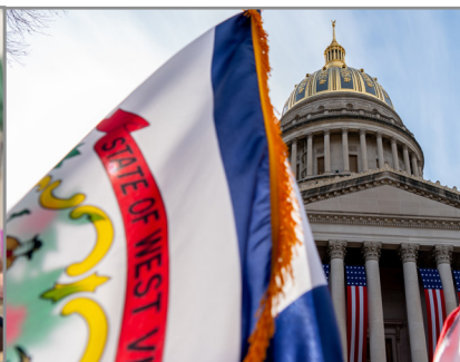
2021 WV Legislative Session p.5