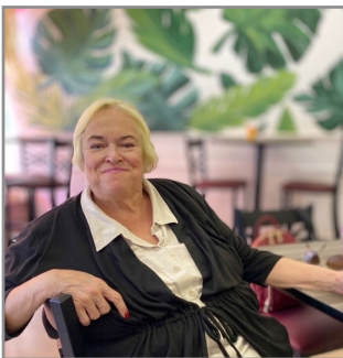
Living the Dream Awards Announced p.2