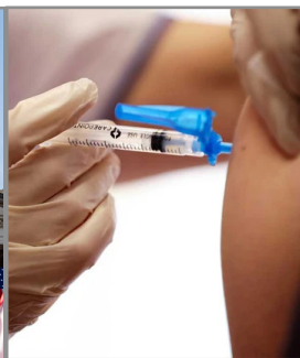
WV Leading COVID-19 Disbursements p.6