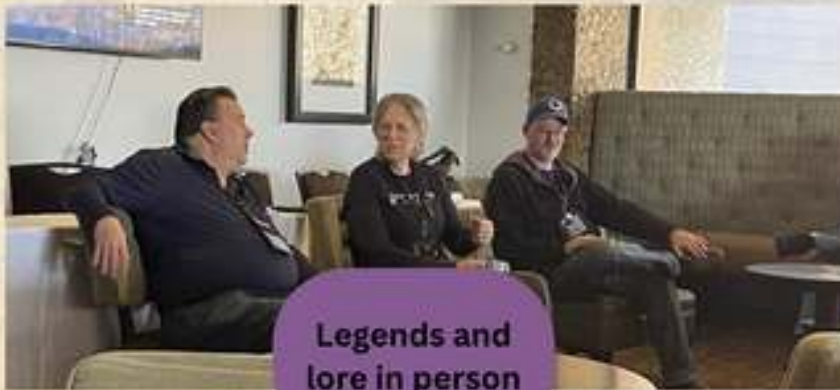
Legends and lore in person