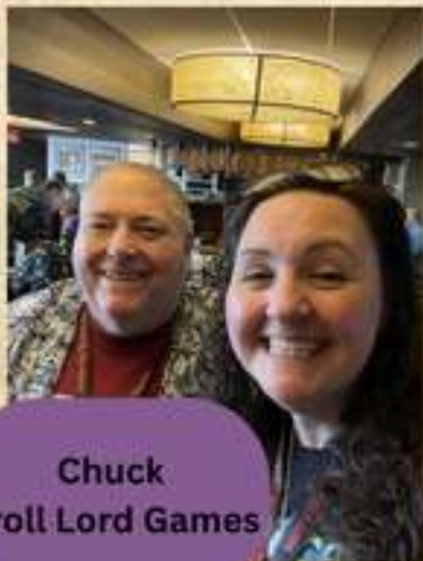
Chuck Troll Lord Games