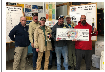
2 nd Place – 180 Points