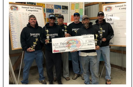
3 rd Place – 147 Points