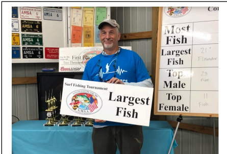
Largest Fish – 21" Flounder