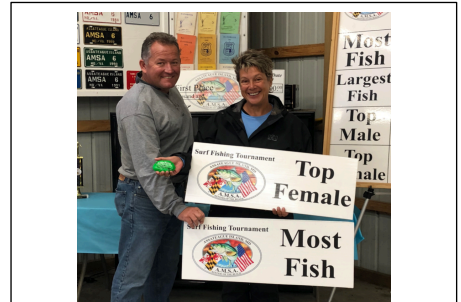
Top Female – 11 Fish