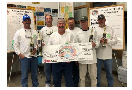
1 st Place – 221 Points