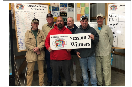
Session 3 Winner – 86 Points