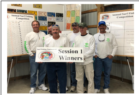
Session 1 Winner – 121 Points