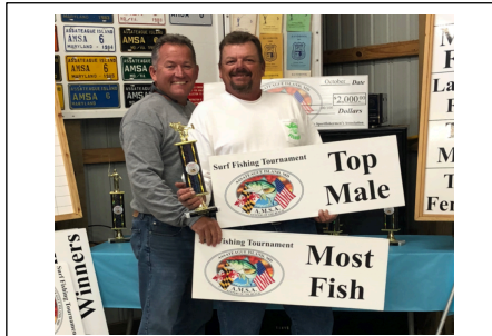
Top Male – 23 Fish