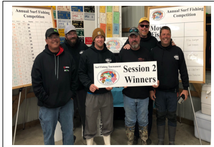
Session 2 Winner – 76 Points