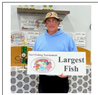
Largest Fish – 17 3/4" Flounder