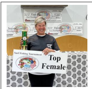
Top Female – 23 points