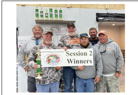
Session 2 Winner