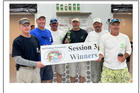
Session 3 Winner