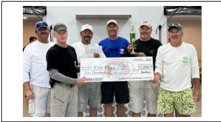
1 st Place