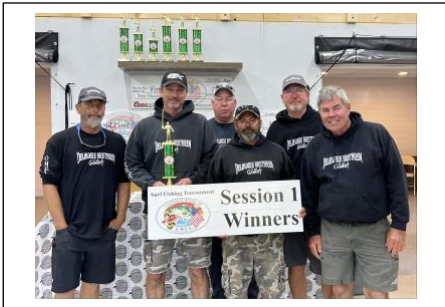
Session 1 Winner