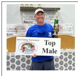
Top Male – 36 points