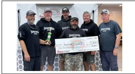
2 nd Place