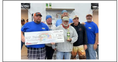
3 rd Place