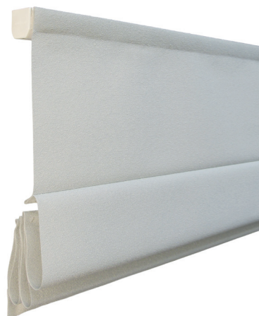
Classic fold roman shade