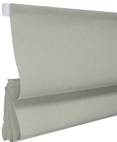
Soft fold roman shade