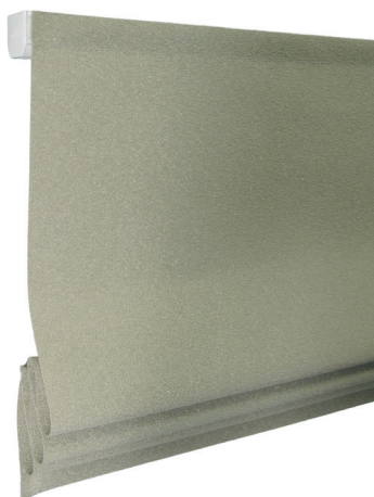
Flat roman shade