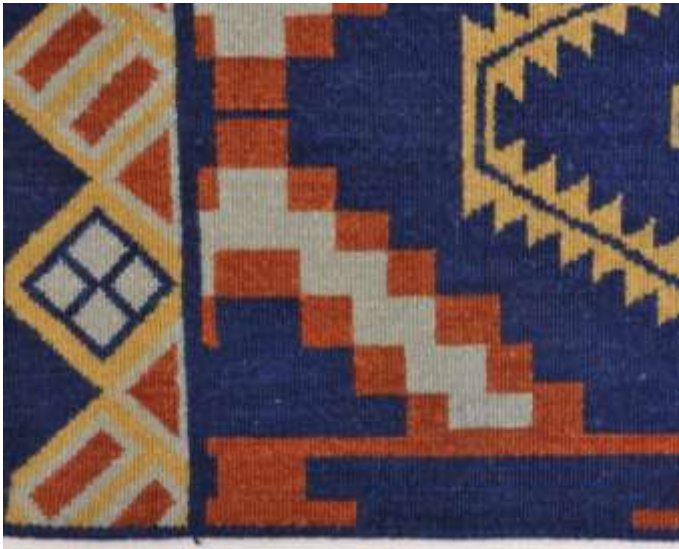
Nourmak Plus – raised and flat