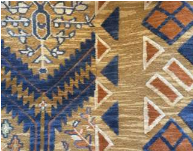
Space Dye Plain Yarn