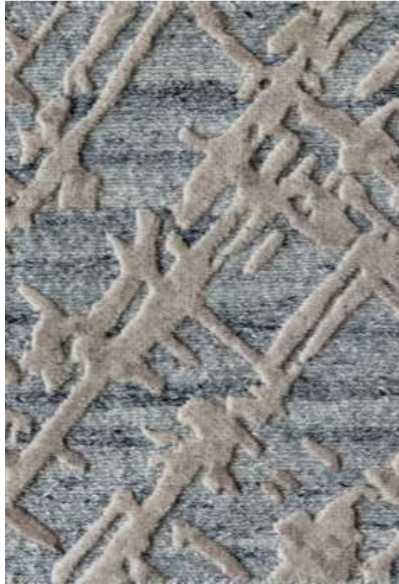
NOURMAK® PLUS WEAVE