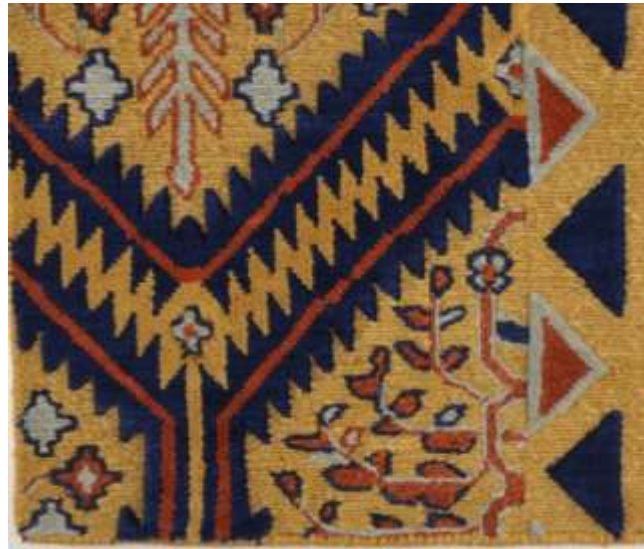
Solid Dye Plain Yarn