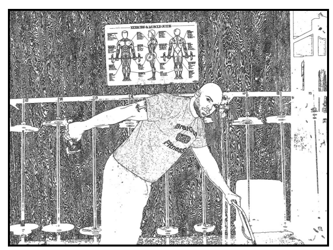
Focus of exercise: triceps

Start with a chair placed arms-length away and stand about 3 feet back from the chair, feet shoulder width apart. Hold an appropriate weight in one hand and bend at the waist, keeping your torso at an angle. Lift the weight up, pulling the elbow past the back and into your body. This is the starting position. Bending only at the elbow, extend your forearm back to straighten the arm, finishing with your arm parallel to the floor. Return to the starting position, in a smooth and controlled movement.