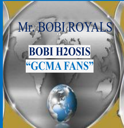
IMAGE - PHOTO YEARS 2025 - 2029 REQUIRED

IDENTIFICATION NUMBER USA - INTERNATIONAL TYPE OF GCMA FAN • WENRC • AFSC • ARC • ATC