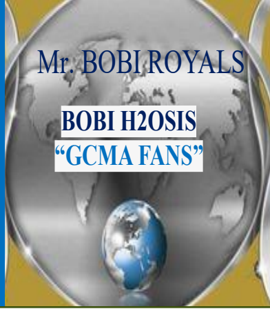
IMAGE – PHOTO YEARS 2025 - 2029 REQUIRED

IDENTIFICATION NUMBER USA – INTERNATIONAL TYPE OF GCMA FAN • WENRC • AFSC • ARC • ATC