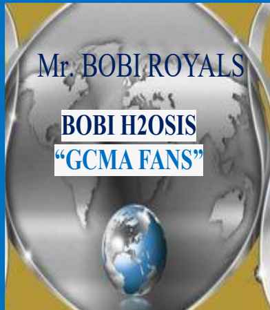
IMAGE – PHOTO YEARS 2025 - 2029 REQUIRED