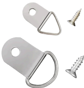
D or V rings