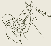
Internal & Loose Stables

Nestled on 30 acres of prime grassland between South Kilvington and Thirsk, Little Nags Stables offers exceptional care, all-year-round turnout, and both local and homegrown hay. Conveniently located near the A19 & A168, we're easily accessible from Thirsk centre, Ripon, Boroughbridge, and Northallerton.