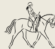
Arena (Coming 2025)