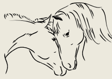
Individual & Mixed Paddocks