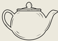
Kitchenette & WC