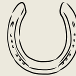
Miles of Hacking