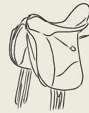
Trailer Parking & Hire