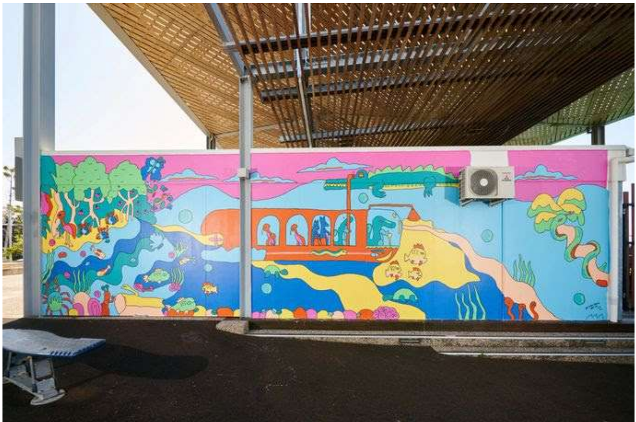
Mural Wrap up: A dive into the bluewater river, Bluewater Quay, Mackay