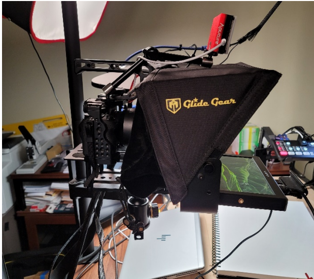
The whole setup