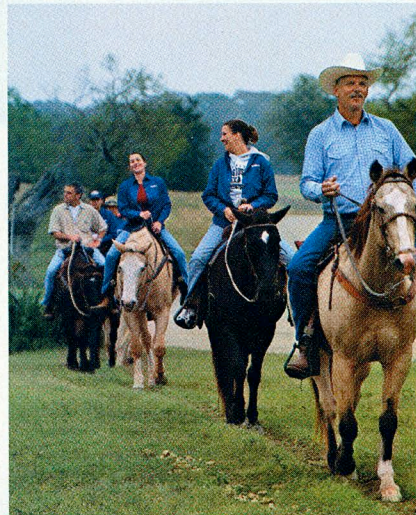
below: A visit to Bandera would be incomplete without a horseback ride through the Hill Country.