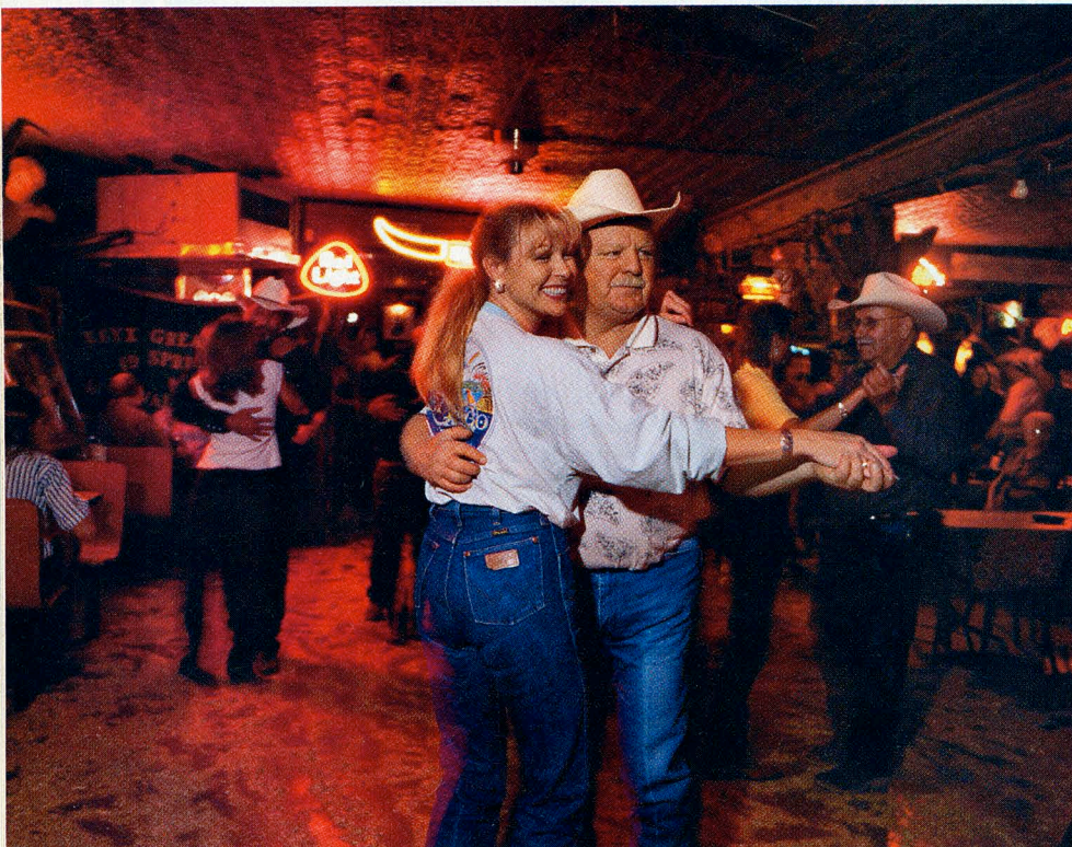
left: Visitors scoot a boot at Arkey Blue's Silver Dollar Saloon on Main Street.