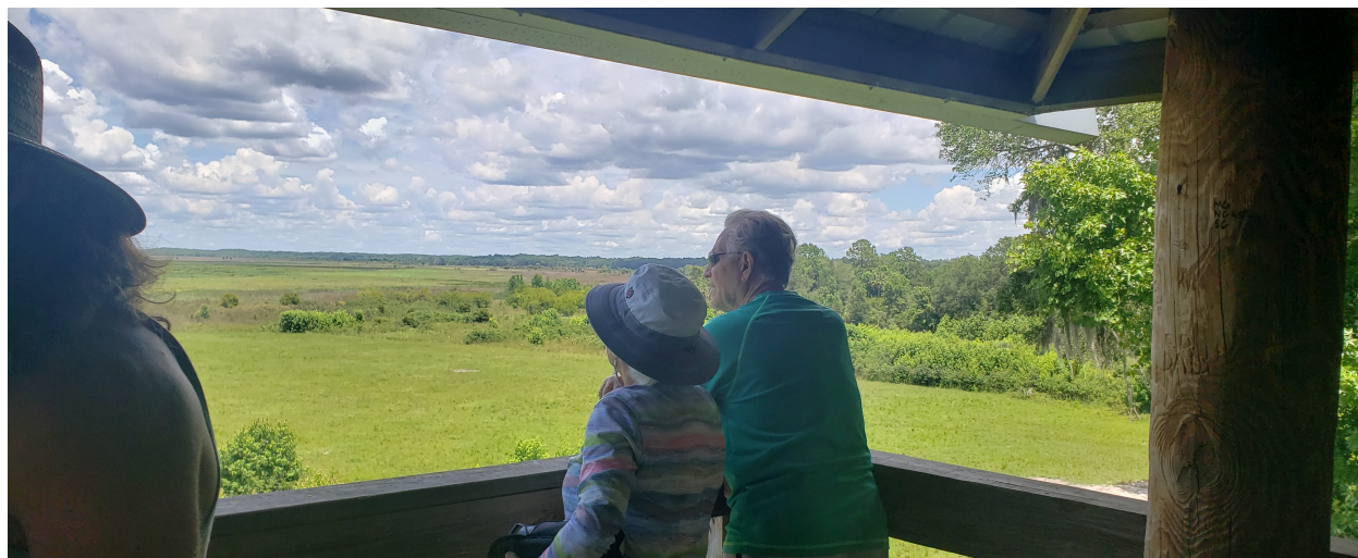
Overlooking Paynes Prairie

Friday we visited Gilchrist Blue Springs state park, did a short hike, then cooled off in the spring. The day ended with bat viewing at Lake Alice on the UF campus.