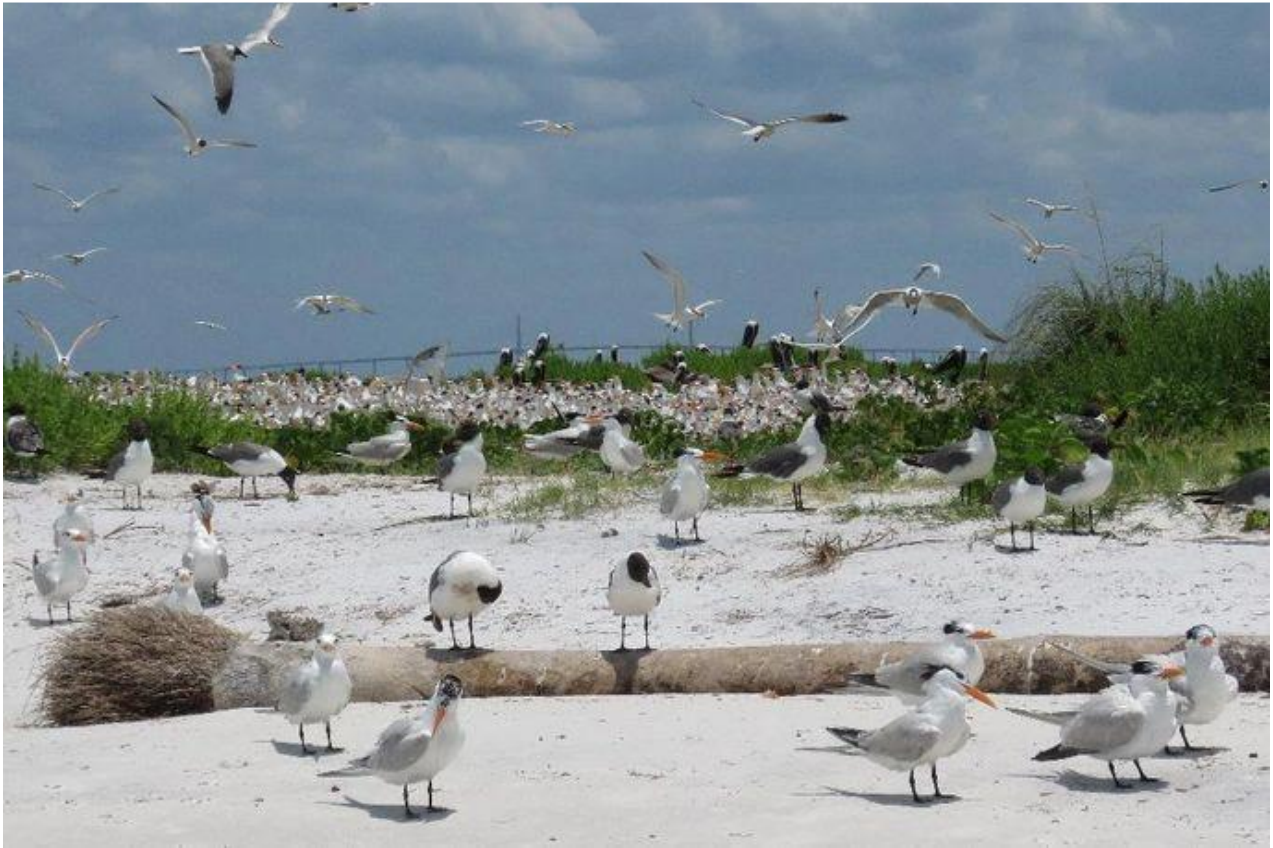
Passage Key National Wildlife Refuge, nesting birds