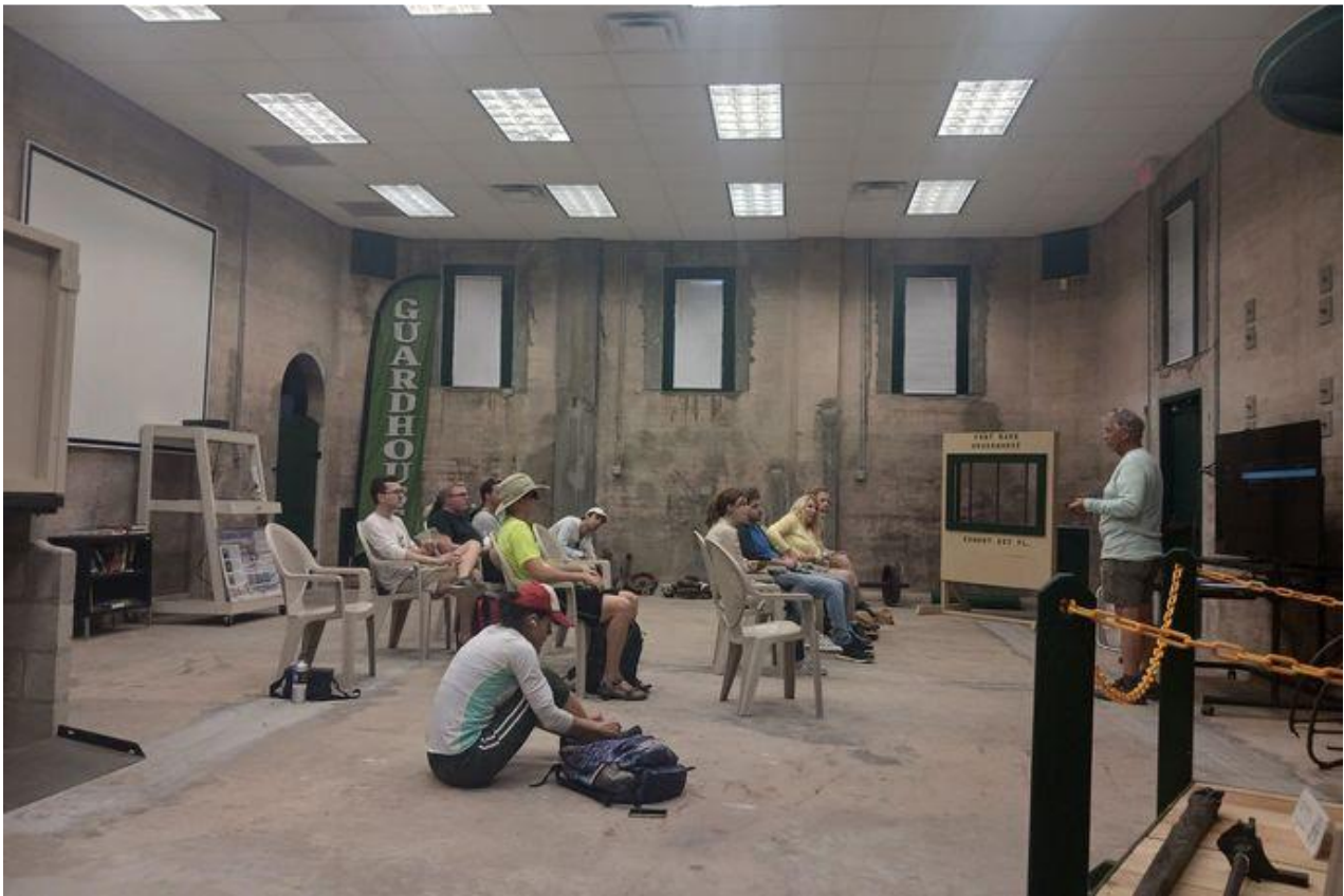
Stetson Law volunteers at the Guardhouse on Egmont Key

It has been a busy spring at the Guardhouse! The Guardhouse is the only place on our three refuges where visitors can find out about the national wildlife refuges of Tampa Bay, so it is important that we keep the doors open. One Saturday in March we welcomed 99 visitors through the door - that is a lot for an island. We would like to thank all of our volunteers for their dedication and patience. To become a docent please go to our website tampabayrefuges.org , click Get Involved, click Guardhouse Docents, and fill out the form.