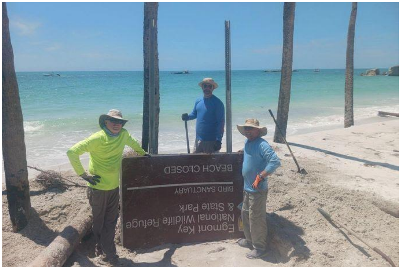
Digging for Signs on Egmont

USFWS staff and Friends volunteers have been working hard to get Egmont Key and Passage Key posted for the summer beach nesting bird season. These postings are critical to enforcement of closed bird sanctuary areas. Without these postings the closed areas would be overrun with beach goers, and the birds would be out of luck. Egmont and Passage Keys are two of the very few protected beach sanctuaries in Tampa Bay. They are especially important because they are islands, free of predators. The signs take a hit from storms every year. The sign crew will find the downed signs, dig them up, brush them off, and reset them. That saves precious refuge dollars for other work.