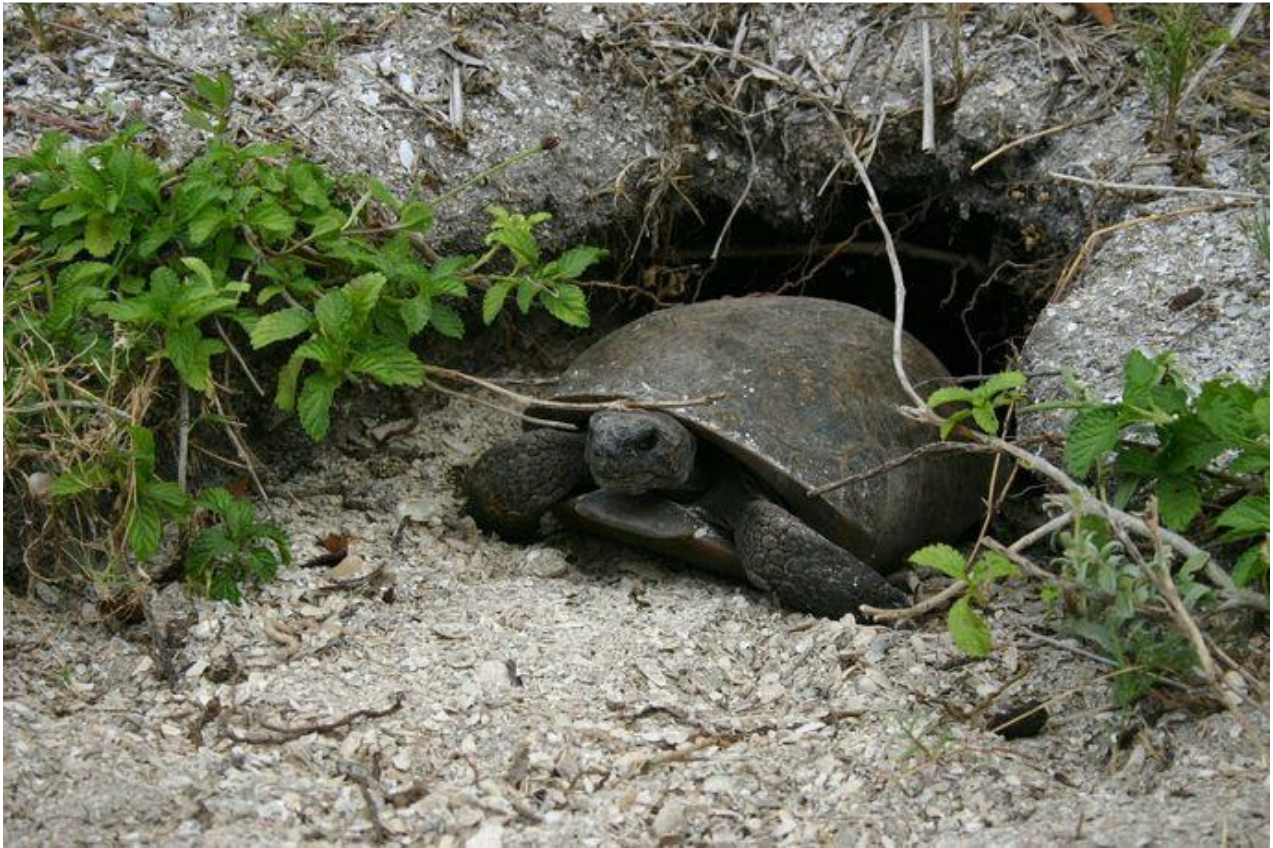
Gopher Tortoise on Egmont Key National Wildlife Refuge

Egmont Key is well known for its Gopher Tortoises - for good reason, there are lots of them. It is said that Egmont has the highest density of gopher tortoises in the state, with a population estimated at over 1,000. The Egmont tortoises are an important population as they are isolated from the mainland populations. They thrive on the island where they have very few predators. Gopher tortoises can live 40 to 60 years in the wild. They dig deep burrows for shelter, and are opportunistic herbivores foraging on low-growing plants near their burrows. You can often find them coming out after a rain to drink water from puddles. GTs share their burrows with more than 350 other species, and are therefore referred to as a keystone species. In Florida, the gopher tortoise is listed as a Threatened Species. Both the tortoise and its burrow are protected under state law. For more information visit: