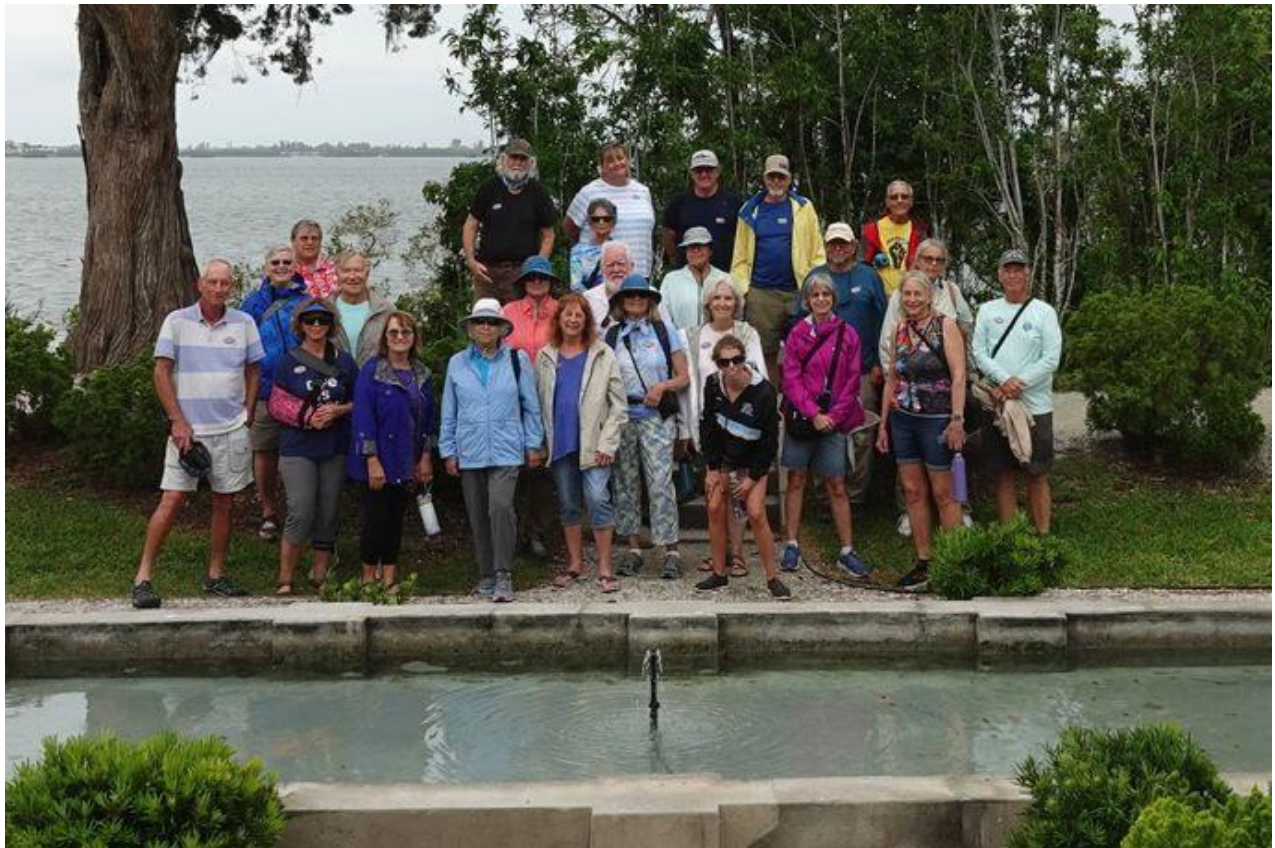
Spanish Point tour