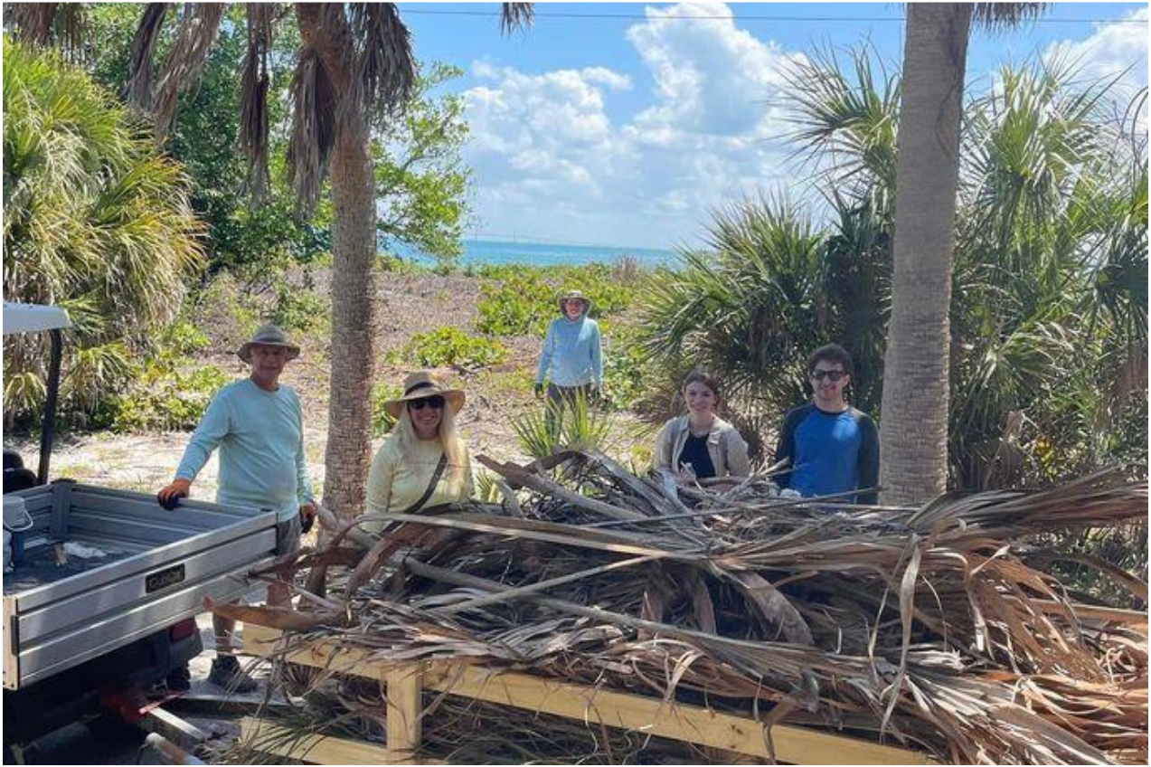
Stetson Law students and staff working on Egmont Key NWR

In April Stetson Law students and staff came out to the island and assisted Florida Park Service and USFWS staff with road and battery clean ups. Thank you all for your hard work!