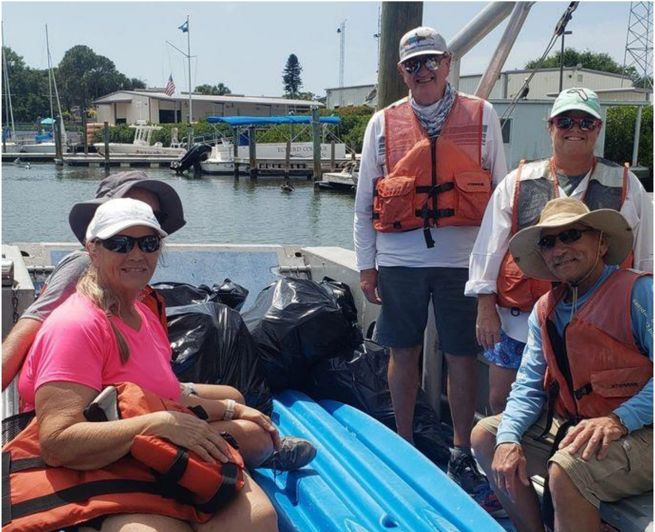
Egmont Key National Wildlife Refuge cleanup volunteers

After a couple of weather cancellations, Friends volunteers finally got out to Egmont and spent a day walking the beach on the east side of the closed area picking up all the beach debris. They collected 12 bags of trash and blue kayak! It was good day on the island. We hope to do more of this soon. Thank you all for your help in keeping Tampa Bay cleaner. Volunteers also rebuilt the brush trailer and put it to good use.