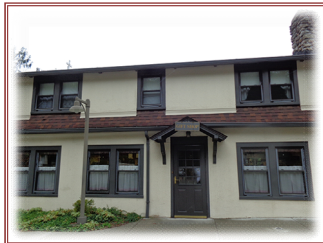
Sisters' Gift Shop