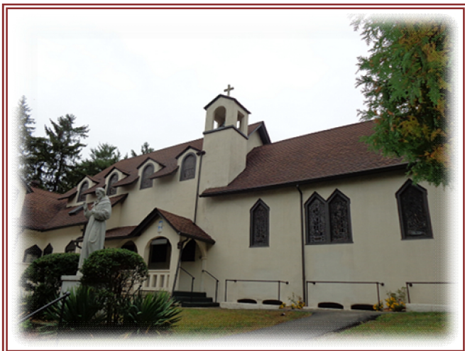
Saint John's Church