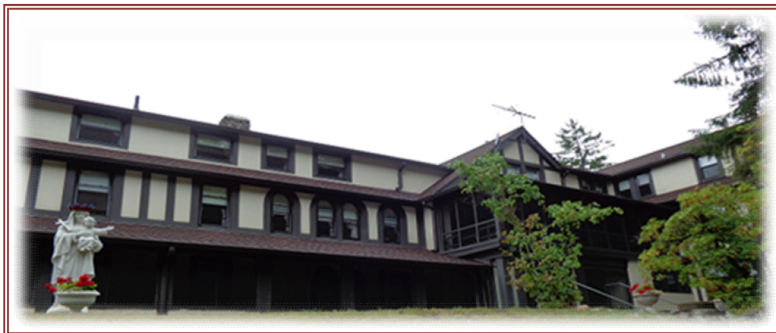
Our Lady of the Atonement Retreat House