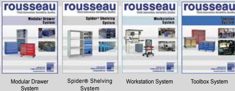
Modular Drawer System