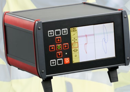
VICTOR 2.2D EDDY CURRENT FLAW DETECTOR