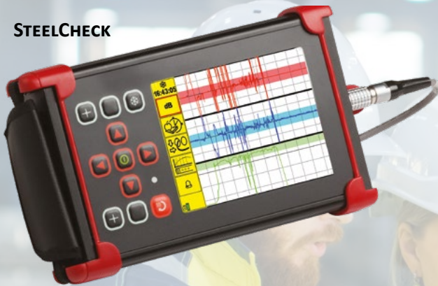
COMPACT 3 CHANNEL FLUX LEAKAGE TUBE TESTING INSTRUMENT