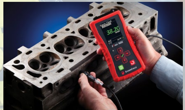
SIGMACHECK CONDUCTIVITY METER

At ETHER NDE we pride ourselves on offering our customers the very best in product design, manufacture and customer care.