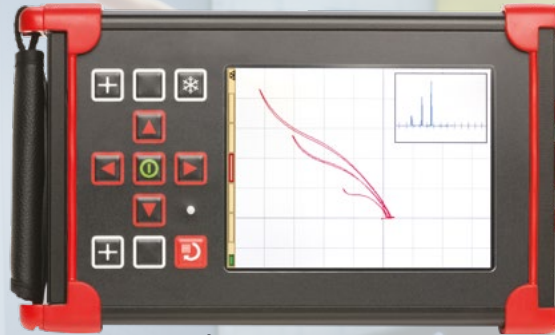
ETHERCHECK/ETHERCHECK R COMBINED EDDY CURRENT & BOND TESTING

At ETHER NDE we pride ourselves on offering our customers the very best in product design, manufacture and customer care.