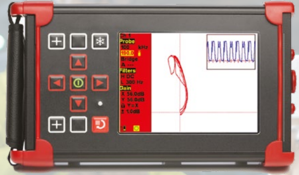
WELDCHECK SERIES EDDY CURRENT FLAW DETECTORS