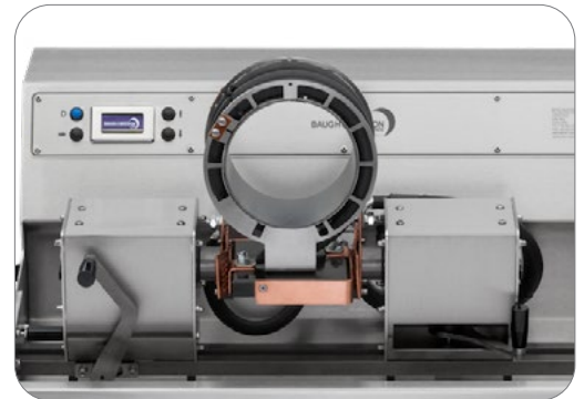
90° Coil Rotation for maximum flexibility