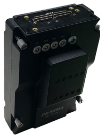
The PragmaPod is modular and ready to support several cartridges for UT, PAUT, ECT, ECA and other advanced NDT methods.