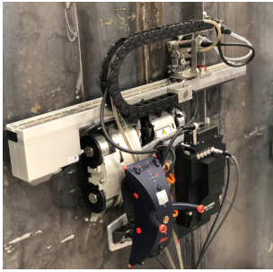
Light enough to be mounted on a magnetic-wheel scanner, to simplify the umbilical. Shown here on a Jireh scanner, alongside a Hexagon Leica T-Probe laser target.