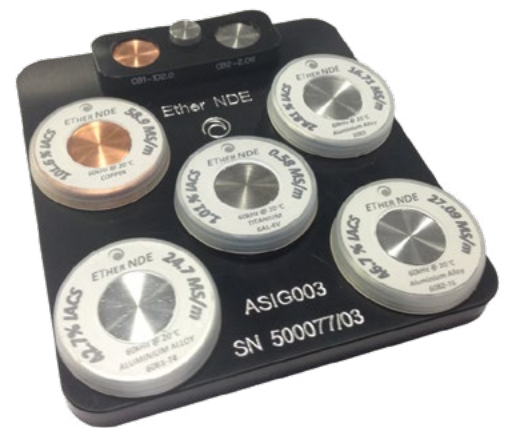
Conductivity Test Blocks In Holder

ETher NDE also manufacture individual conductivity test blocks which may be used to match the clients own testing requirements. We can also provide a handy test block holder (Part number: ASIG003) that can hold up to five of these test blocks at any one time as shown above.