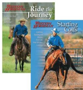
Ride The Journey, Colt Starting, plus more books available.