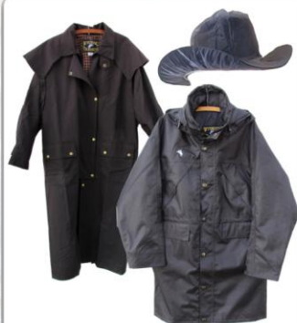
Oilskin Rain Slickers, Oxford Rain Coats, Clear Hat Covers