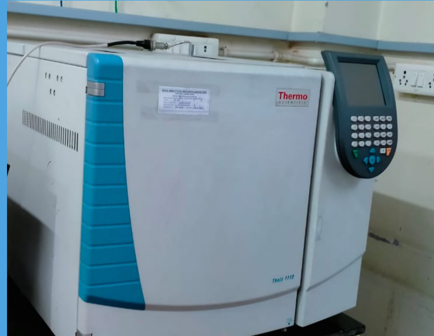
GC With FID ECD & NPD