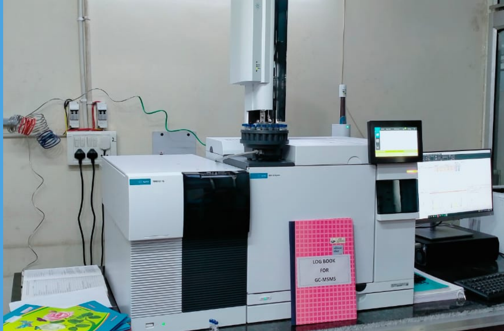
GC MS MS Agilent