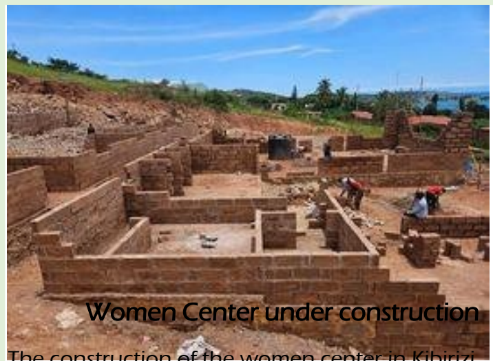
Women Center under construction

The construction of the women center in Kibirizi, Kigoma, is in progress. The vision for this center is to provide a safe and empowering space for women in the community to receive education, support, and resources for personal and professional development.