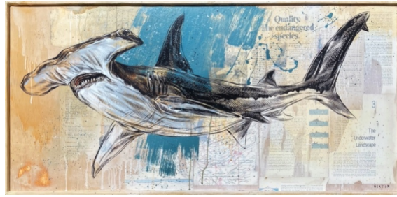
Ben Horton, Endangered Quality , 2022, acrylic and mixed media on wood, 24 x 48 in