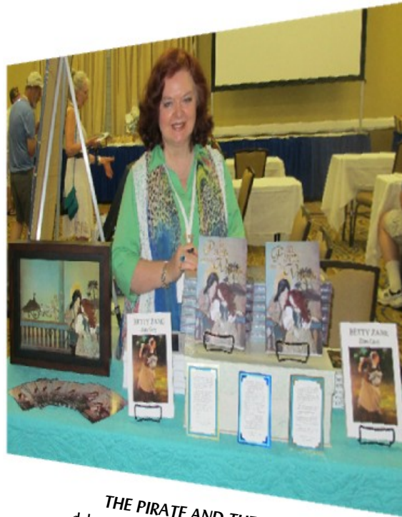
THE PIRATE AND THE VIRGIN debuts at the Zane Grey's West Society, Member Book Fair in Islamorada, FL (June 2016).

Did You Know? Zane Grey (1872-1939) is best known as the author of Western romances like Riders of the Purple Sage and Light of Western Stars . But he was also a world-renowned fisherman and Southwest Florida—especially Long Key—was one of his favorite fishing haunts.