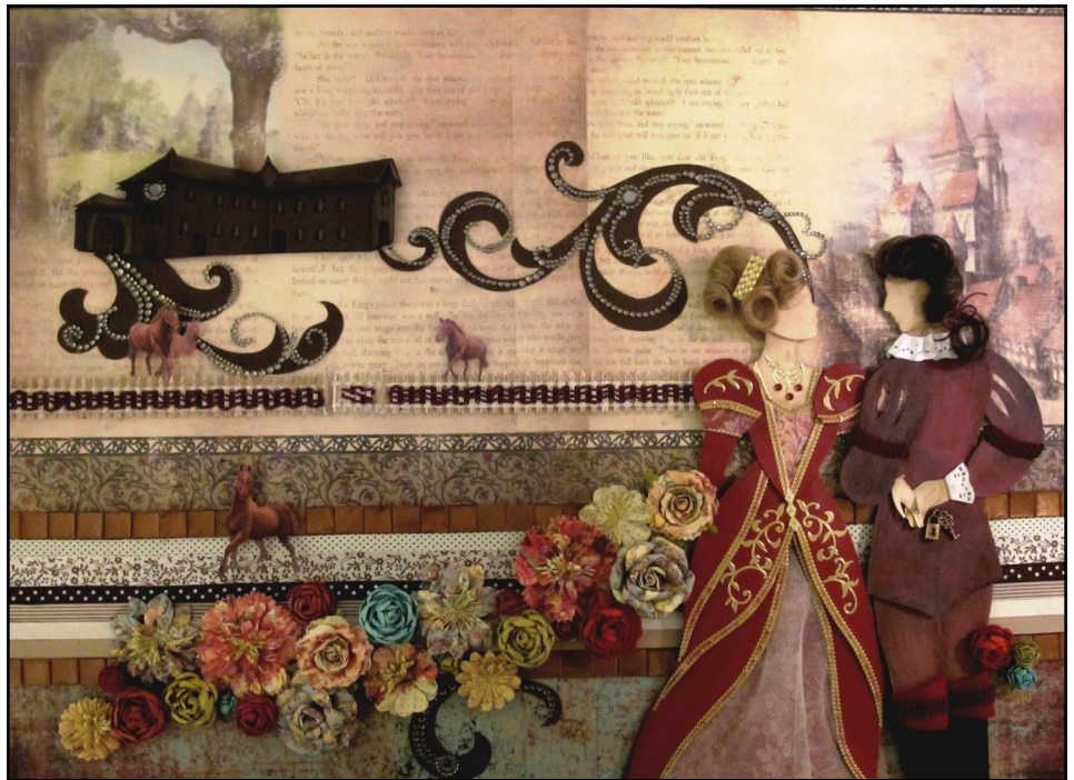
Original artwork: mixed-media collage created as wrap-around cover for The Viscount and the Valet