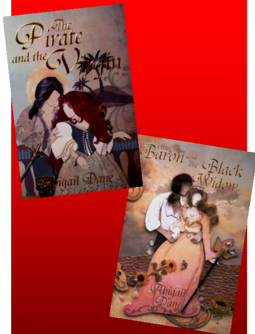
Above: Covers for The Pirate and the Virgin and The Baron and the Black Widow were created in the same way as the cover for The Viscount and the Valet .