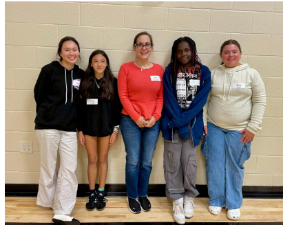
PHOTO OF OUR FUTURE STEM FORCE

Photo taken Oct. 7, 2024 at the Meet & Greet