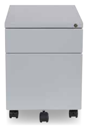
PM22BF 22" Deep Mobile Box/File Pedestal 15.5"W x 22"D x 20.5"H