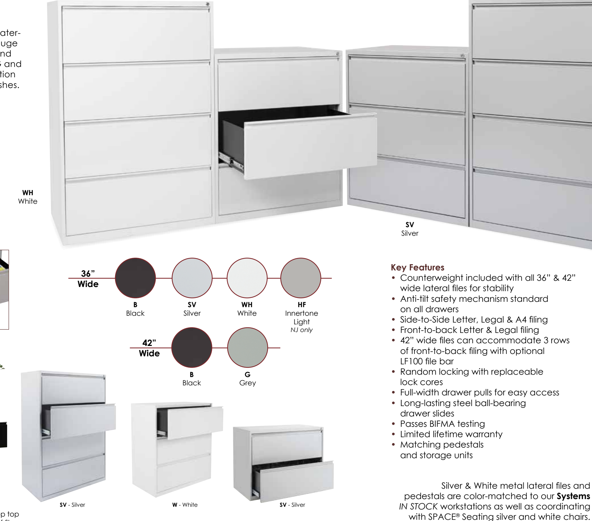
B - Black5-Drawer Files feature lift-top top drawer for easier viewing of files

Commercial-quality lateral files with heavy-gauge steel. Factory-built and fully assembled. MIG and TIG-welded construction with powdercoat finishes.