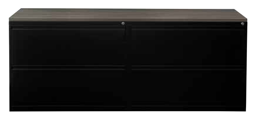
Shown Right in Urban Walnut: LFT7220 72" Wide Top fits (2) 36" wide lateral files

Laminate Tops match our laminate casegoods and systems worksurfaces. Both 36" & 72" wide tops are available in four colors.