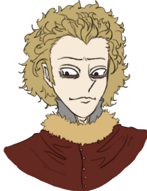
Elias Marianus Archain the Patient Coronation Age: 32 11 years as sovereign