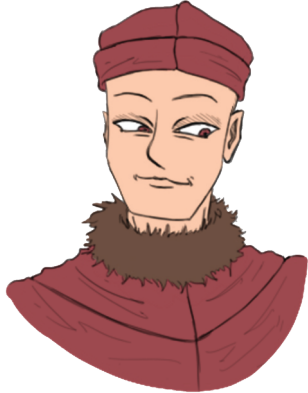
Macbeth Bennett the Bald Coronation Age: 20 15 years as sovereign