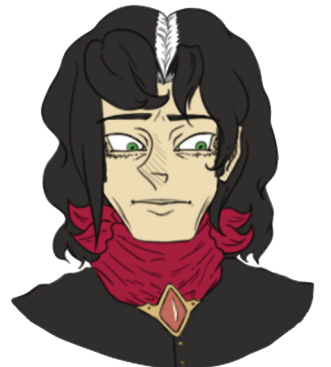
Maslow Edward Archain the Immortal Coronation Age: 32 42 years as sovereign