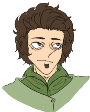
Cornelius Godric Archain the Strong Coronation Age: 16 25 years as sovereign