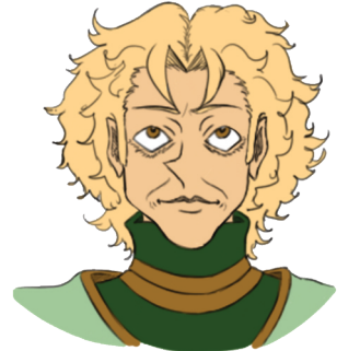
Elias Frost Archain the Considerate Coronation Age: 45 10 years as sovereign