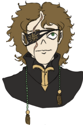
Samuel Bennett the Heretic Coronation Age: 17 65 years as sovereign