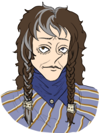
Elias Rodwin Archain the Mad Coronation Age: 56 17 years as sovereign