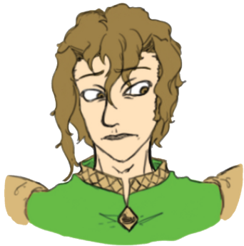
Gautmar Bennett the Quiet Coronation Age: 17 26 years as sovereign