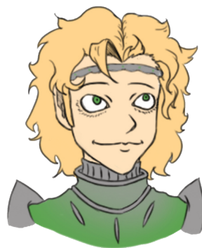
Cornelius Nathaniel Archain the Young Coronation Age: 6 14 years as sovereign