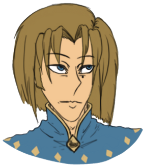
Facetus Bennett the Overindulgent Coronation Age: 26 5 years as sovereign