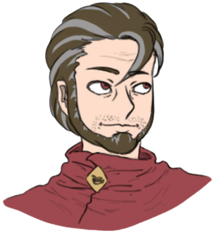
Everbald Bennett the Foolhardy Coronation Age: 54 8 years as sovereign