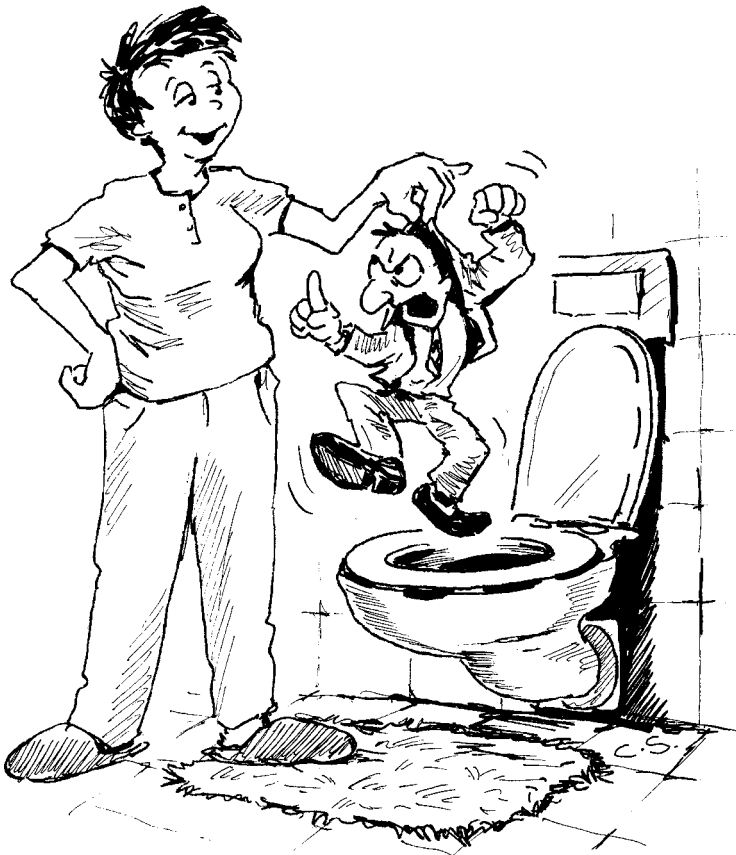
Figure 9.1 Overcoming Parent Modes

After discriminating between messages from the Healthy Adult and Dysfunctional Parent Modes you should decide which of these messages you want to carry on receiving and which you want to cut right back. Aim to keep the messages of the Healthy Adult Mode and to put onto the change agenda those messages that are putting pressure on you or giving you a bad feeling about yourself. In addition, you should start to adopt healthier, more moderate rules for messages in need of revision (see Section 2.1.2).