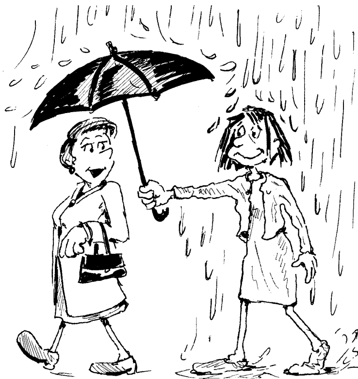
Figure 3.2 Guilt-inducing Parent Mode