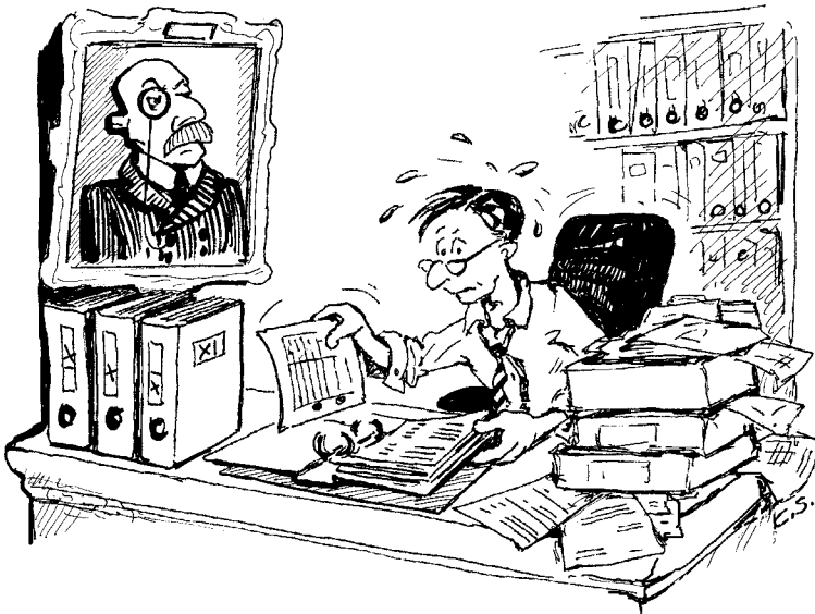
Figure 3.1 Demanding Parent Mode

It is often quite easy to pick out parents or parent figures with high standards in the life stories of people with strong Demanding Parent Modes. They may say about their childhood, “An A grade was good for my father, a B was OK, but he would always