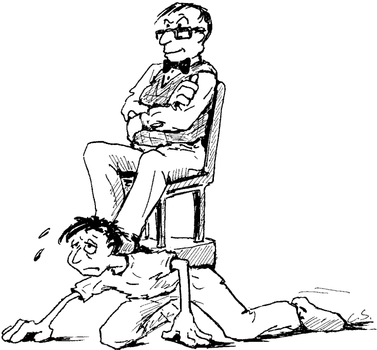
Figure 4.1 Surrendering

In this chapter you will learn more about these three coping styles. As a first step we will give you an overview on how to distinguish them.