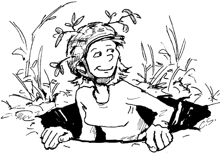
Figure 10.1 Reducing avoidance

Your pro and con list is very important here, too, because it helps you to keep the long-term disadvantages of avoidance in the front of your mind. This may support and strengthen your motivation for change. The reduction and weakening of avoidance follows the same rules as for surrendering (see Exercise 10.2 and Worksheet 16, "Pros and cons of my Coping Mode"). You can also use an imagery exercise like 10.3 in this case.