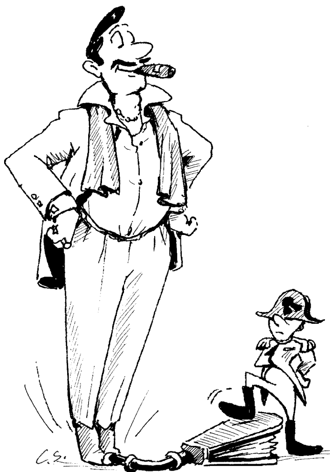
Figure 4.3 Overcompensation

Just like avoidance, overcompensation can take many forms. What they all have in common is that the overcompensating person seeks to control and dominate the situation. Everyone else gets the feeling that it's impossible to go against the wishes and opinions of the overcompensating person.