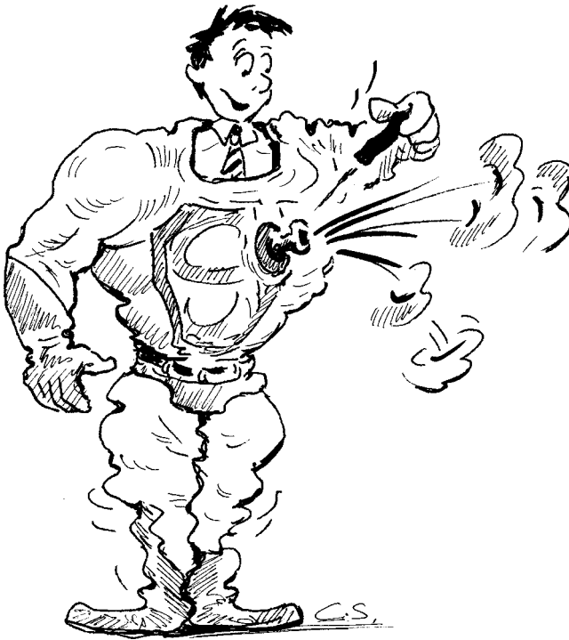
Figure 10.2 Reducing overcompensation

Understandably, people are usually only motivated to reduce overcompensation if they experience some disadvantages from it – other people drawing back, or their partner threatening to leave them. If you're going through this process you may become depressed or anxious at first. This may sound harsh, but experience has shown that it's true: negative experiences with overcompensation can increase your chances of a successful reduction of overcompensation. They can motivate your change! You may not start working on your overcompensation without the spur of such negative consequences – as long as people accommodate themselves to your wishes, you probably won't consider changing your ways.