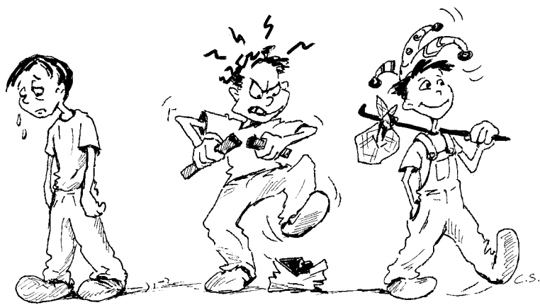
Figure 2.1 Child Modes