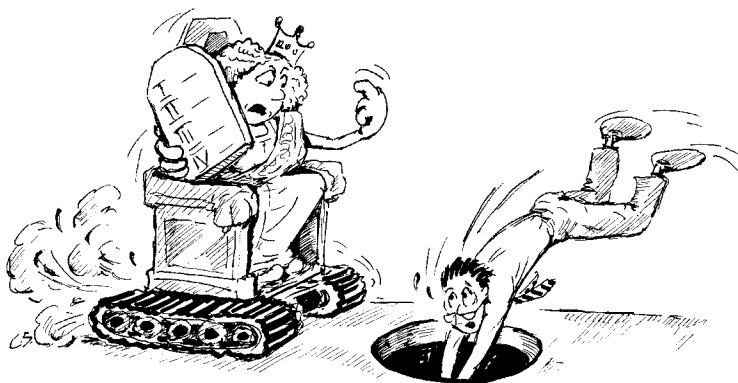
Figure 4.2 Avoidance

Overcompensation. Overcompensation means that someone confronts a deficit with an excess. We talk about an overcompensating coping style when someone behaves as if the opposite of their Vulnerable Child and Dysfunctional Parent Modes' messages were true. For example, someone who is feeling inferior