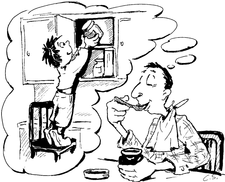
Figure 8.1 Happy Child Mode

Follow the “principle of small steps”! If you haven't experienced much of the Happy Child Mode in your life so far, it will not burst into flower overnight. You have to care for and be careful with your Happy Child Mode. Be sure of one thing: it will reward you for every small step, and many small steps will take you a long way!