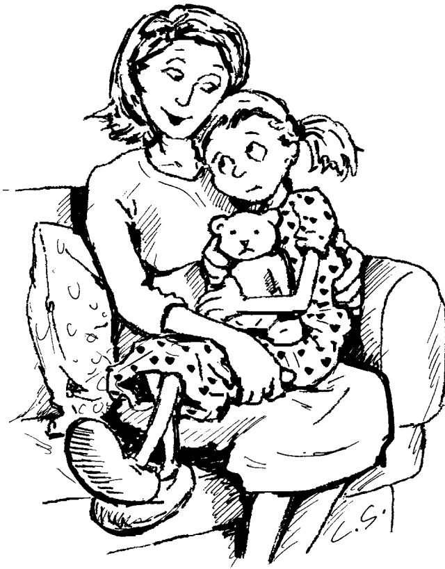
Figure 6.1 Healthy Adult – Happy Child

When your Vulnerable Child Mode is triggered, just close your eyes and try to sense what you really want and need now. What needs of yours are not being met right now? Does this remind you of a childhood memory? Can you take better care of those needs today than you could when you were a child?