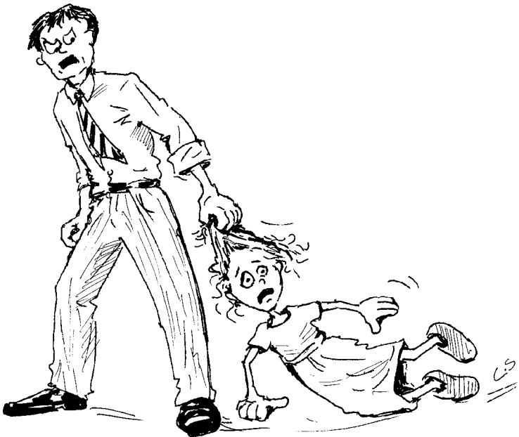
Figure 3.3 Punitive Parent Mode

There are different types of abuse that can result in a Punitive Parent Mode. Some people even experience several types of abuse simultaneously.