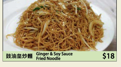
豉油皇炒麵 Ginger & Soy Sauce Fried Noodle $18