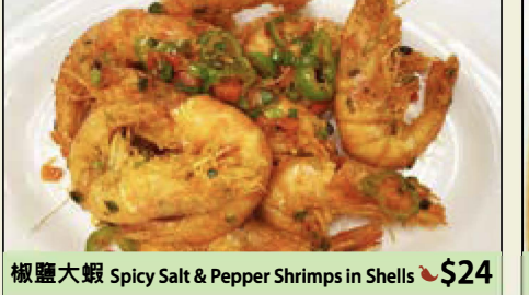
椒鹽大蝦 Spicy Salt & Pepper Shrimps in Shells $24