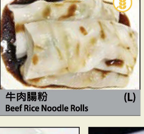
牛肉腸粉 (L) Beef Rice Noodle Rolls