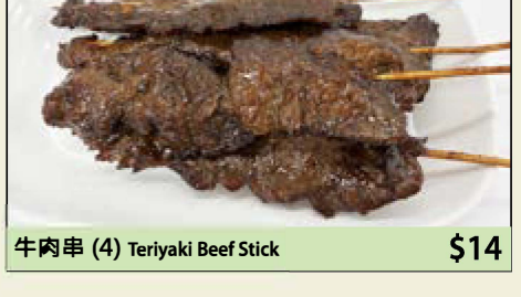
牛肉串 (4) Teriyaki Beef Stick $14