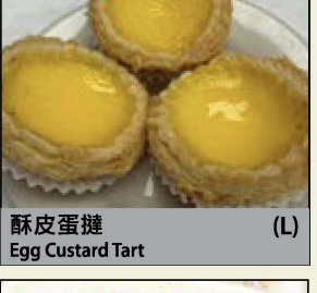
酥皮蛋撻 (L) Egg Custard Tart