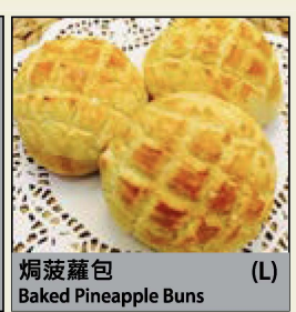
焗菠蘿包 (L) Baked Pineapple Buns