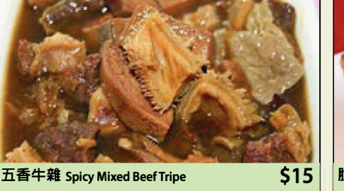
五香牛雜 Spicy Mixed Beef Tripe $15