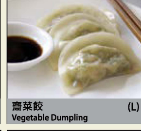
齋菜餃 (L) Vegetable Dumpling