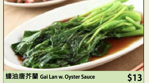
蠔油唐芥蘭 Gai Lan w. Oyster Sauce $13