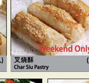
叉燒酥 (L) Char Siu Pastry