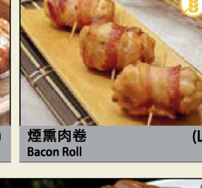
煙熏肉卷 (L) Bacon Roll