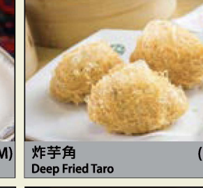
炸芋角 (L) Deep Fried Taro