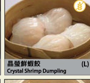
晶瑩鮮蝦餃 (L) Crystal Shrimp Dumpling