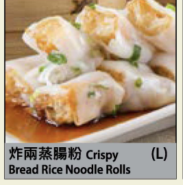
炸兩蒸腸粉 Crispy Bread Rice Noodle Rolls (L)