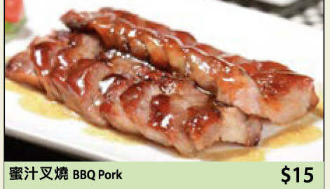
蜜汁叉燒 BBQ Pork $15