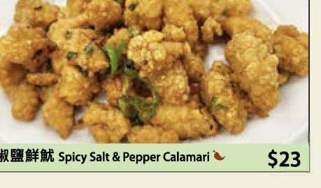
椒鹽鮮魷 Spicy Salt & Pepper Calamari $23