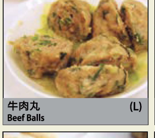
牛肉丸 (L) Beef Balls