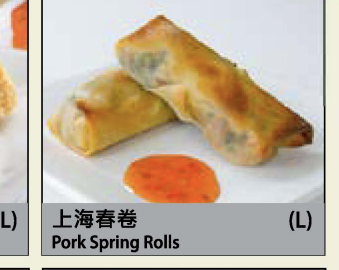
上海春卷 (L) Pork Spring Rolls