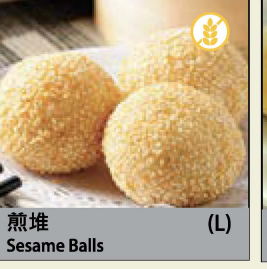
煎堆 (L) Sesame Balls