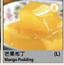
芒果布丁 (L) Mango Pudding