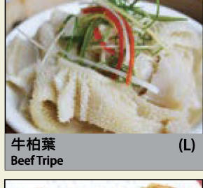
牛柏葉 (L) Beef Tripe