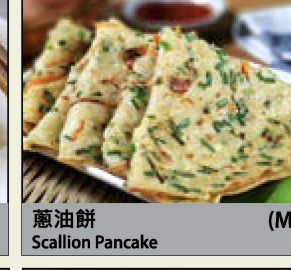
蔥油餅 (M) Scallion Pancake