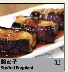
釀茄子 (L) Stuffed Eggplant