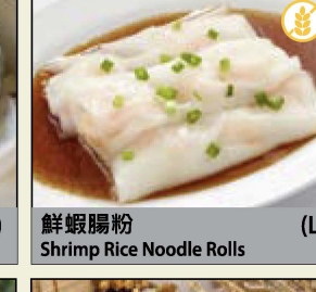
鮮蝦腸粉 (L) Shrimp Rice Noodle Rolls