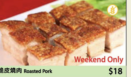
脆皮燒肉 Roasted Pork $18