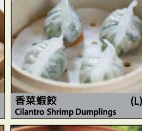
香菜蝦餃 (L) Cilantro Shrimp Dumplings