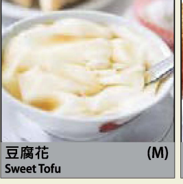
豆腐花 (M) Sweet Tofu