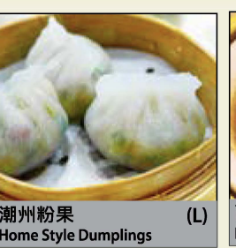
潮州粉果 (L) Home Style Dumplings