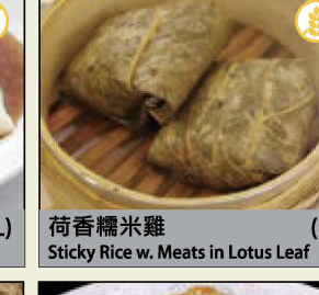
荷香糯米雞 (L) Sticky Rice w. Meats in Lotus Leaf