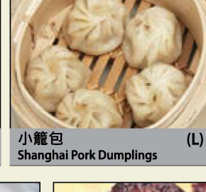
小籠包 (L) Shanghai Pork Dumplings