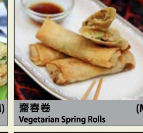
齋春卷 (M) Vegetarian Spring Rolls