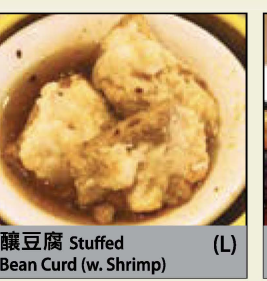
釀豆腐 Stuffed Bean Curd (w. Shrimp) (L)