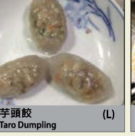
芋頭餃 (L) Taro Dumpling