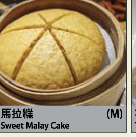
馬拉糕 (M) Sweet Malay Cake