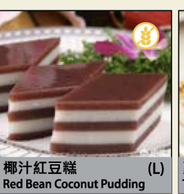
椰汁紅豆糕 (L) Red Bean Coconut Pudding