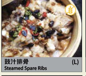
豉汁排骨 (L) Steamed Spare Ribs