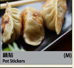
鍋貼 (M) Pot Stickers