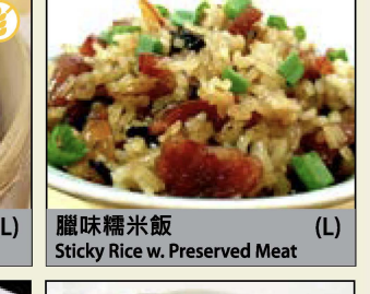
臘味糯米飯 (L) Sticky Rice w. Preserved Meat