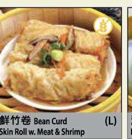
鮮竹卷 Bean Curd Skin Roll w. Meat & Shrimp