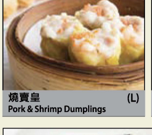
燒賣皇 (L) Pork & Shrimp Dumplings