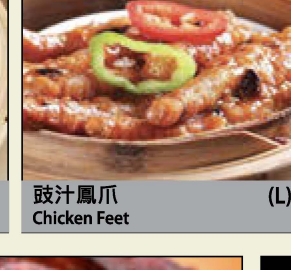
豉汁鳳爪 (L) Chicken Feet