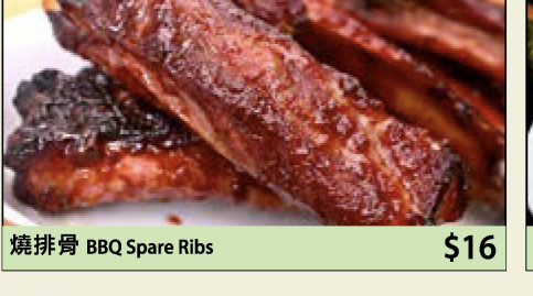
燒排骨 BBQ Spare Ribs $16