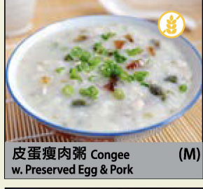
皮蛋瘦肉粥 Congee w. Preserved Egg & Pork (M)