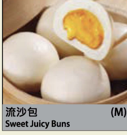
流沙包 (M) Sweet Juicy Buns