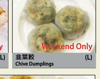
韭菜餃 (L) Chive Dumplings