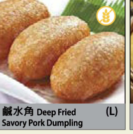
鹹水角 Deep Fried Savory Pork Dumpling (L)