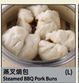
蒸叉燒包 (L) Steamed BBQ Pork Buns