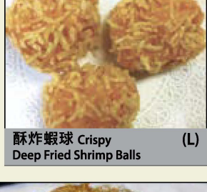
酥炸蝦球 Crispy Deep Fried Shrimp Balls (L)