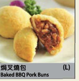
焗叉燒包 (L) Baked BBQ Pork Buns