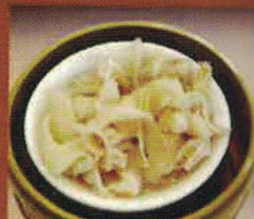
釀葱牛柏葉 Beef Tripe (M)