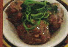
西菜牛肉球 Beef Balls (M)