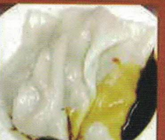
牛肉蒸腸粉 Beef Rice Noodle Rolls (M)