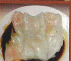
鮮蝦蒸腸粉 Shrimp Rice Noodle Rolls (L)