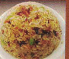
腊味糯米飯 Sticky Rice w/ Preserved Meat (L)