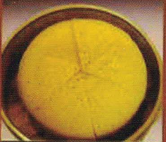
馬拉糕 Malay Cake (M)