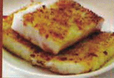
蘿蔔糕 Turnip Cake (M)