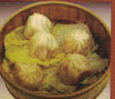
上海小籠飽 Shanghai Pork Dumplings (L)