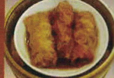
鮮竹卷 Stuffed Tofu Skin Rolls (M)