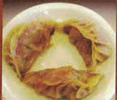
煎餃子 Pan Fried Pork Dumpling (M)