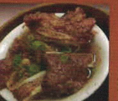
黑椒牛仔骨 Black Pepper Beef Short Ribs (L)