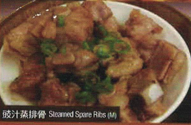
豉汁蒸排骨 Steamed Spare Ribs (M)