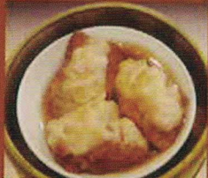
釀豆腐 Stuffed Bean Curd (M)