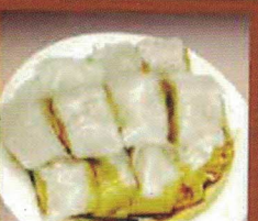
炸兩蒸腸粉 Crispy Bread Rice Noodle Rolls (M)