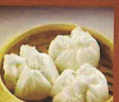
蒸叉燒飽 Steamed B.B.Q. Pork Bun (S)

Special (SP)$7.50 Large (L) $4.25 Medium (M) $3.25 Small (S) $2.75