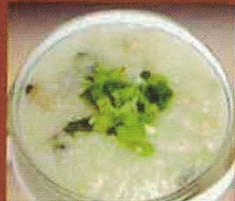
皮蛋瘦肉粥 Congee w/ Preserved Pork & Egg (M)