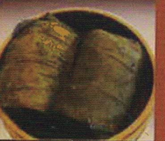
荷香糯米雞 Sticky Rice w/ Meals in Lotus Leaf (L)