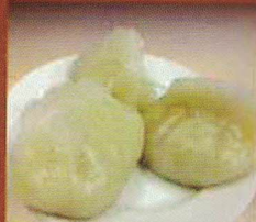
潮州蒸粉果 Vegetable & Peanut Dumpling (M)