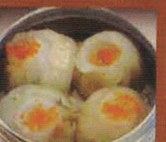
魚子韭菜餃 Chives Dumpling w/ Fish Roe (L)