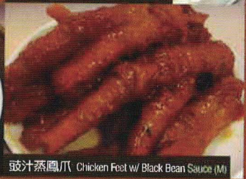
豉汁蒸鳳爪 Chicken Feet w/ Black Bean Sauce (M)